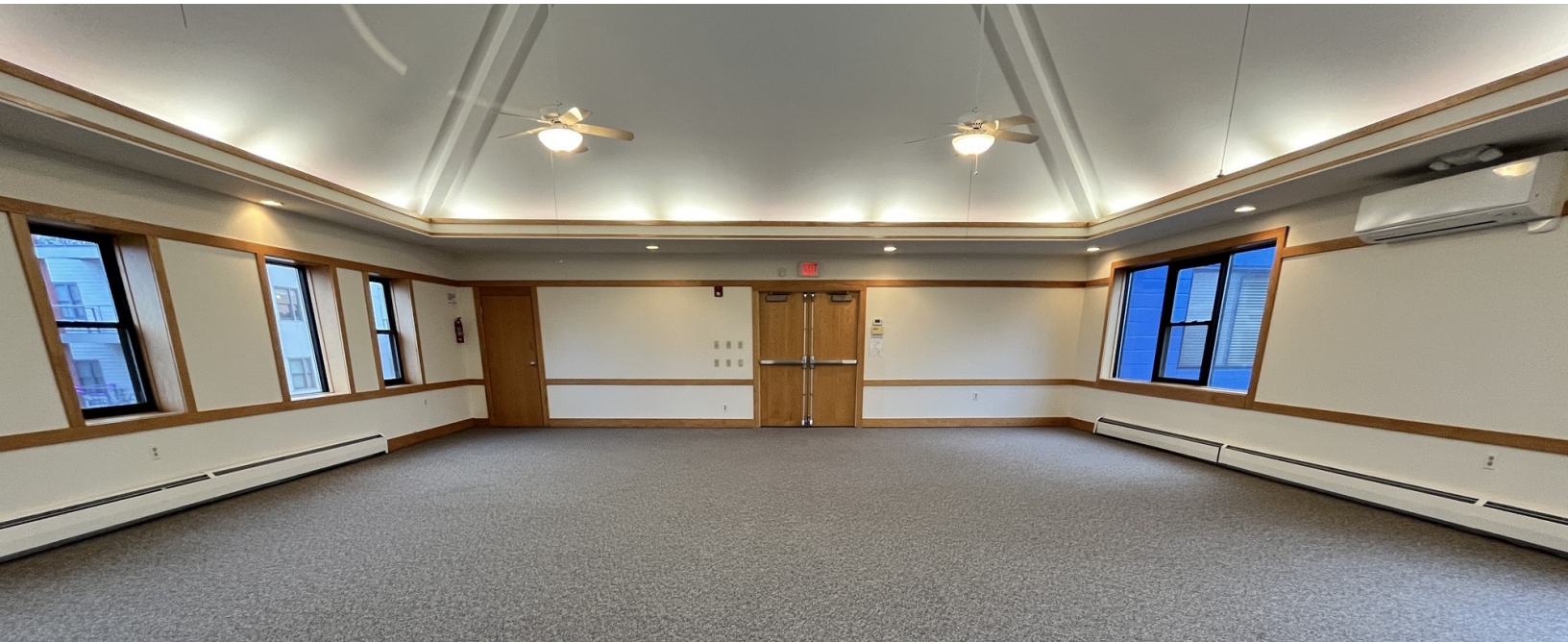
1,150 SF meeting/conference room