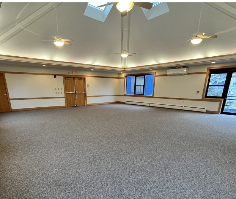
Meeting/conference room has tons of overhead lighting