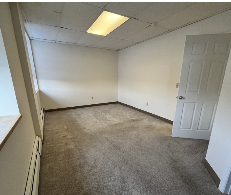
Bedroom off the kitchen/dining area can also be a private office