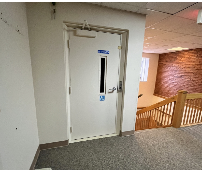
Elevator for access