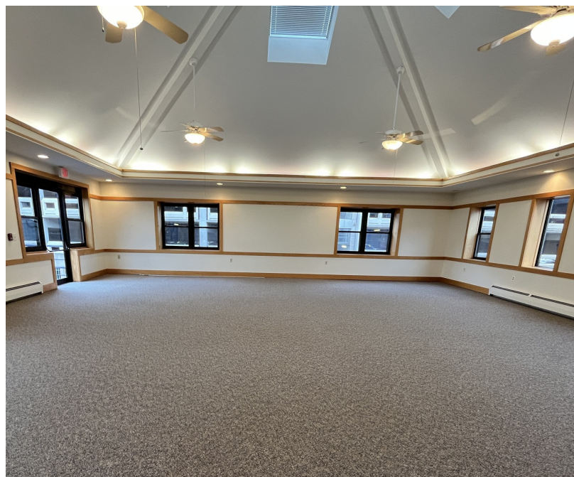
Meeting/conference room has four skylights for added natural light