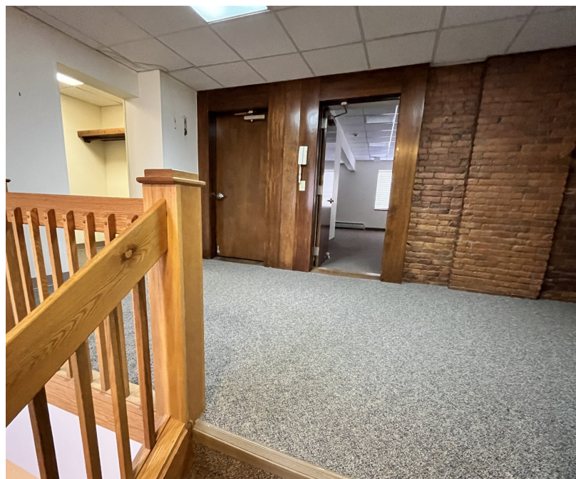
Large foyer is open and inviting