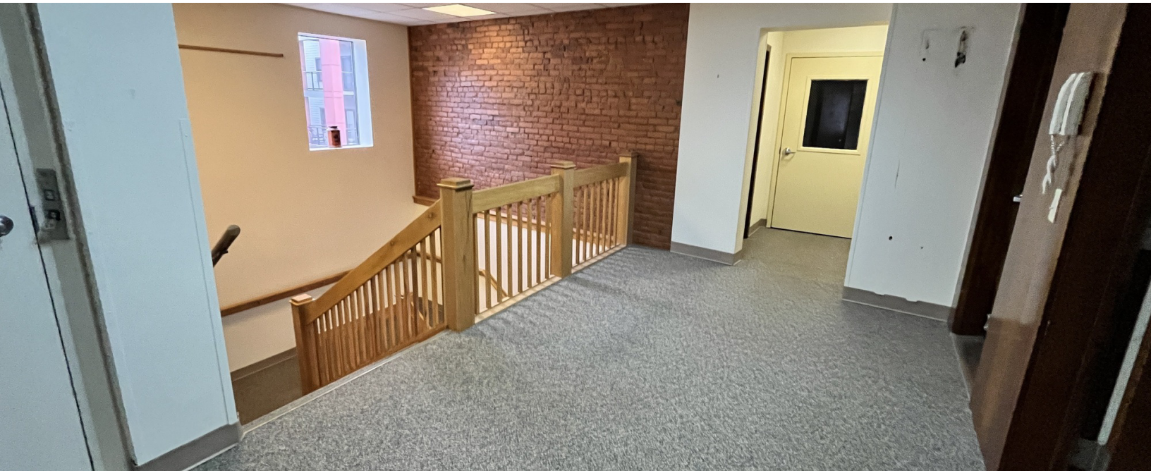
Large foyer at entrance to spaces/rooms