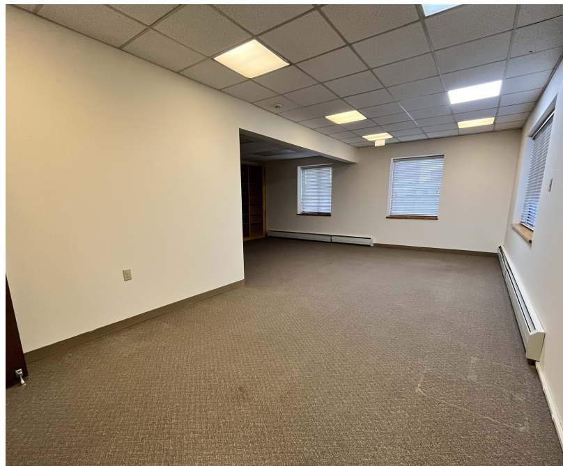
Large room that can be used as shared offices or meeting space