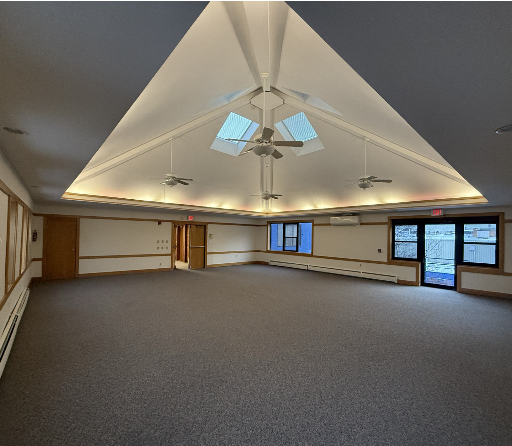
1,150 SF meeting/conference room