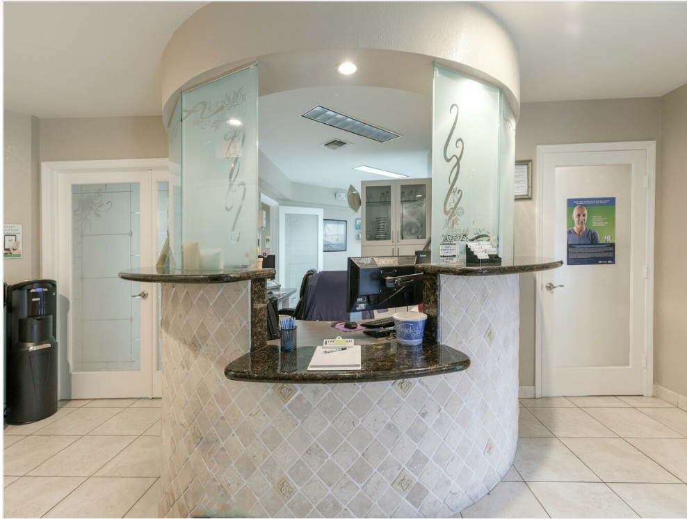
Lobby Reception -CAP18992