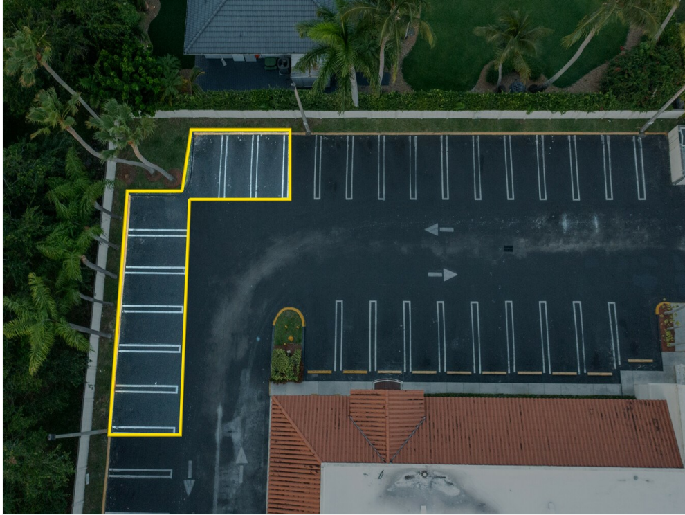
Drone Parking Markers DJI_0404-1