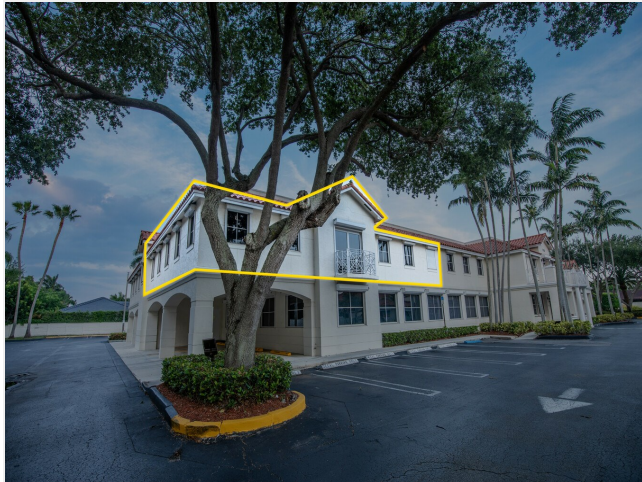
Building Exterior - Marked up -CAP19303-1