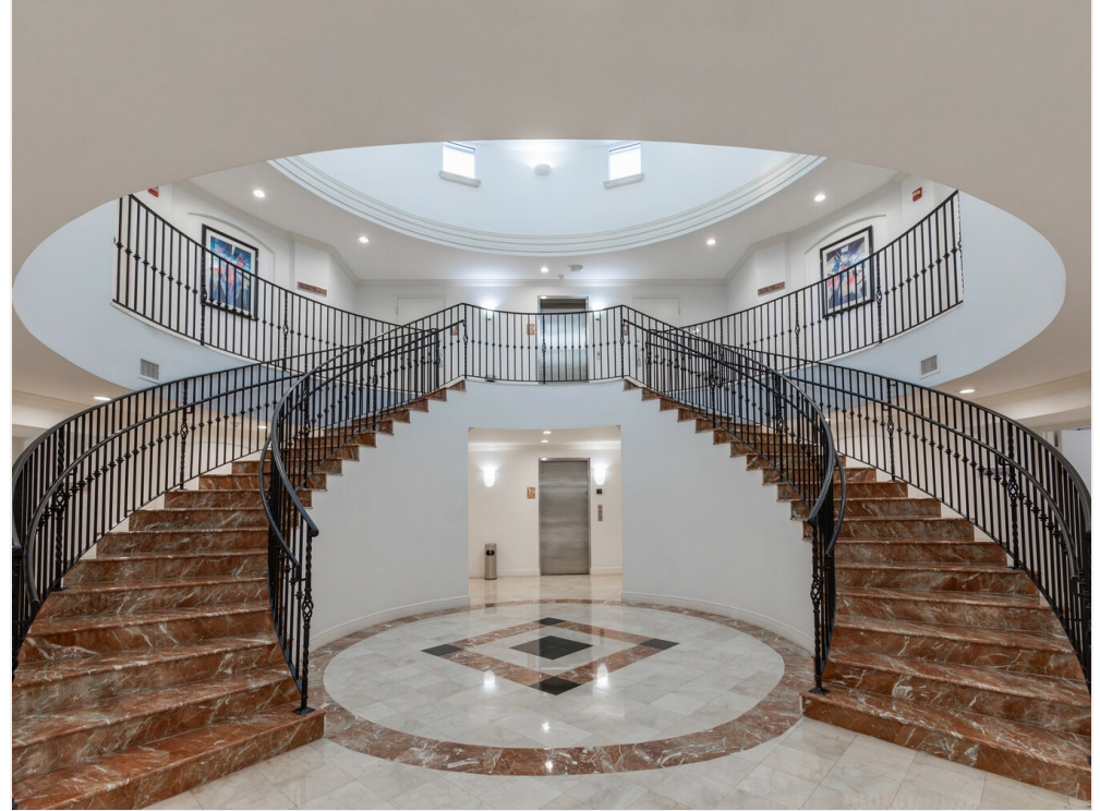
Grand Lobby -CAP19276