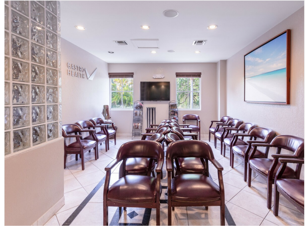
Lobby Entrance 02 -CAP18974