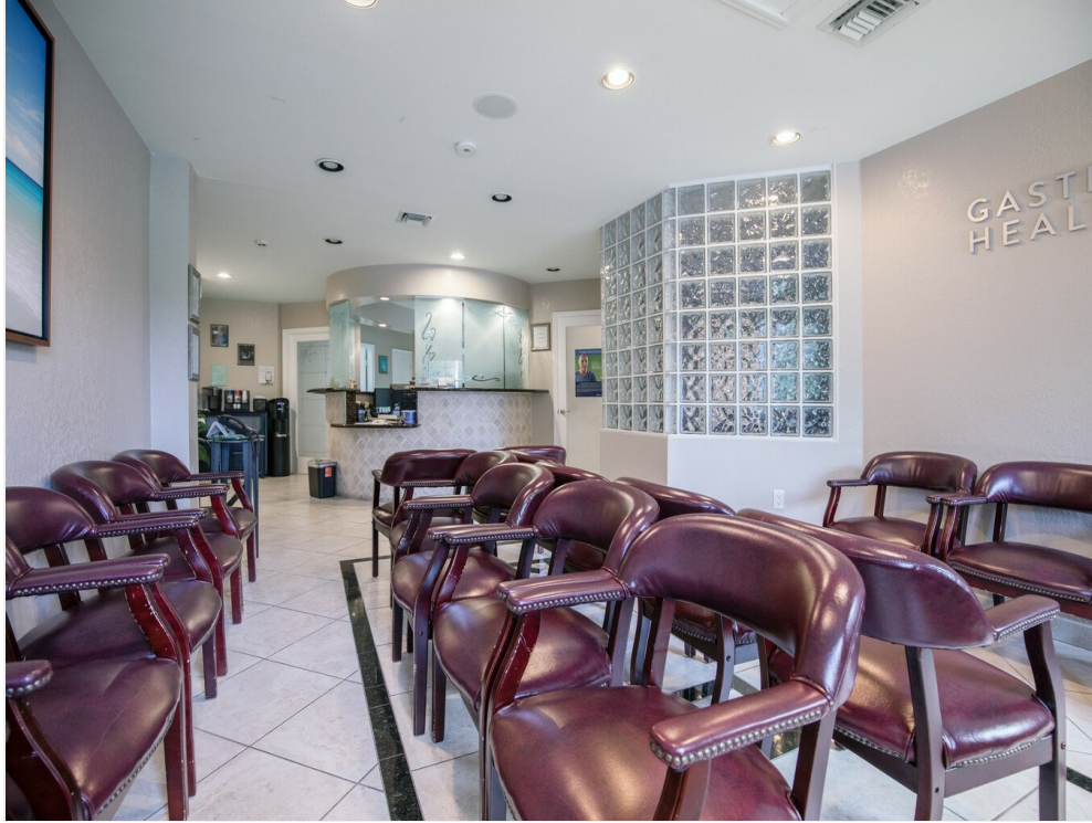
LOBBY ENGRANCE 04 -CAP18986