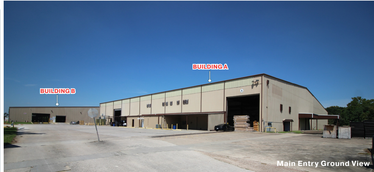
Main Entry Ground View