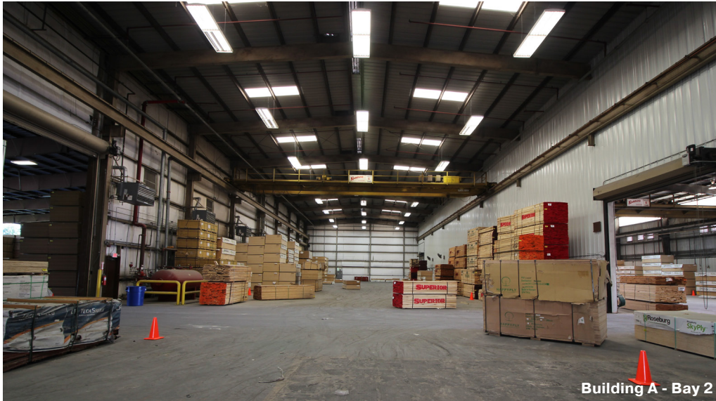
Building A - Bay 2