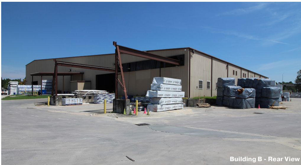
Building B - Rear View