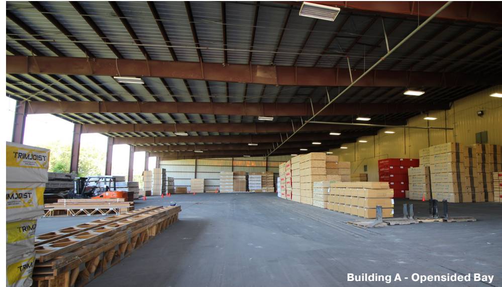
Building A - Opensided Bay