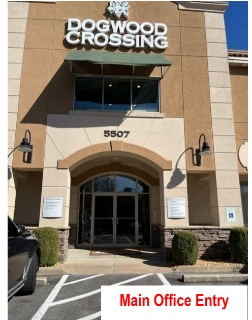
Main Office Entry