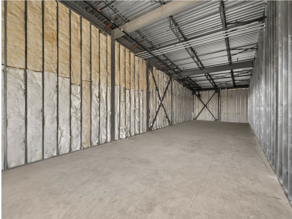
227 E Cevallos