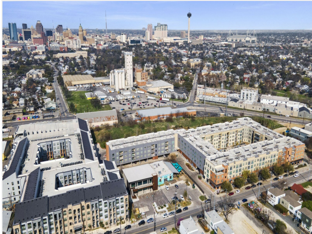
227 E Cevallos