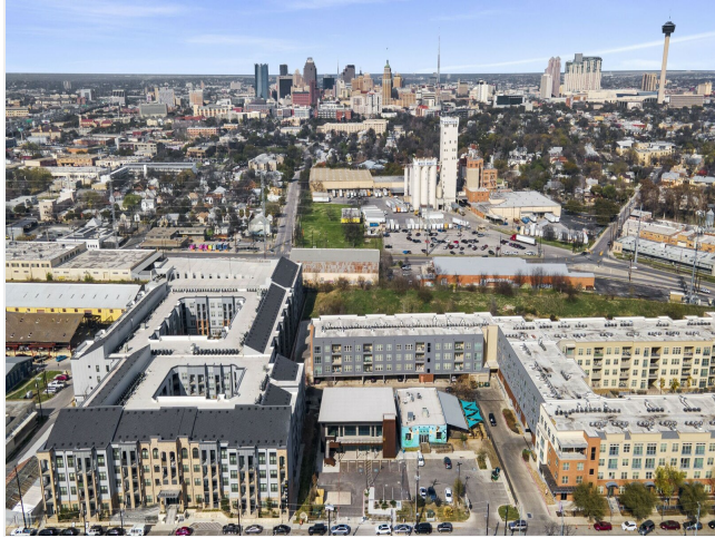
227 E Cevallos