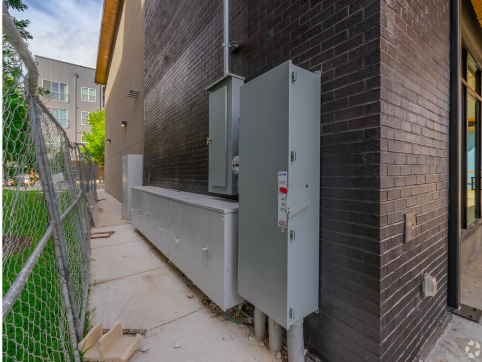
Chic Retail Hub