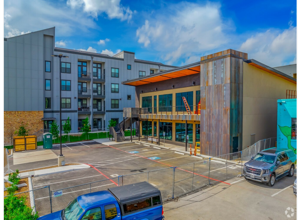
Surrounded by Luxury Apartments