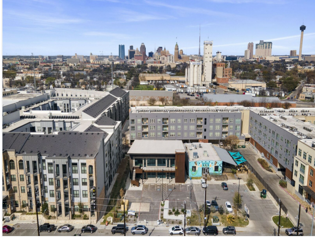
227 E Cevallos