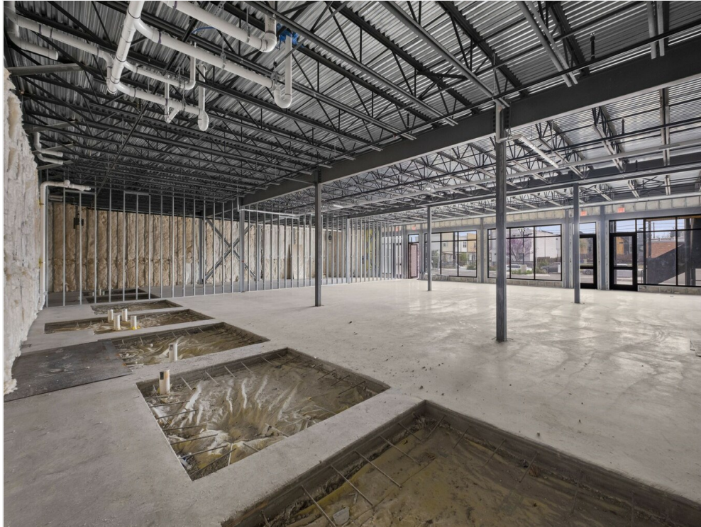
227 E Cevallos