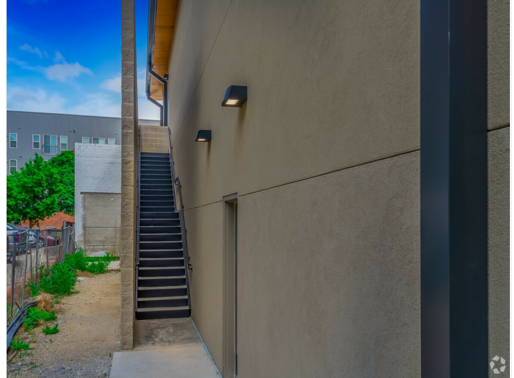
Built in 2023