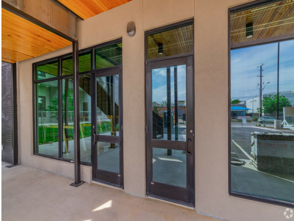
Tapped into an Affluent and Energetic Consumer Pool