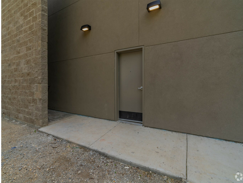
Surrounded by Luxury Apartments