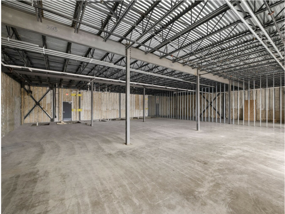
227 E Cevallos