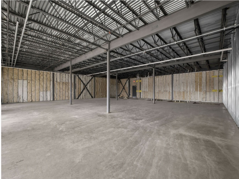
227 E Cevallos