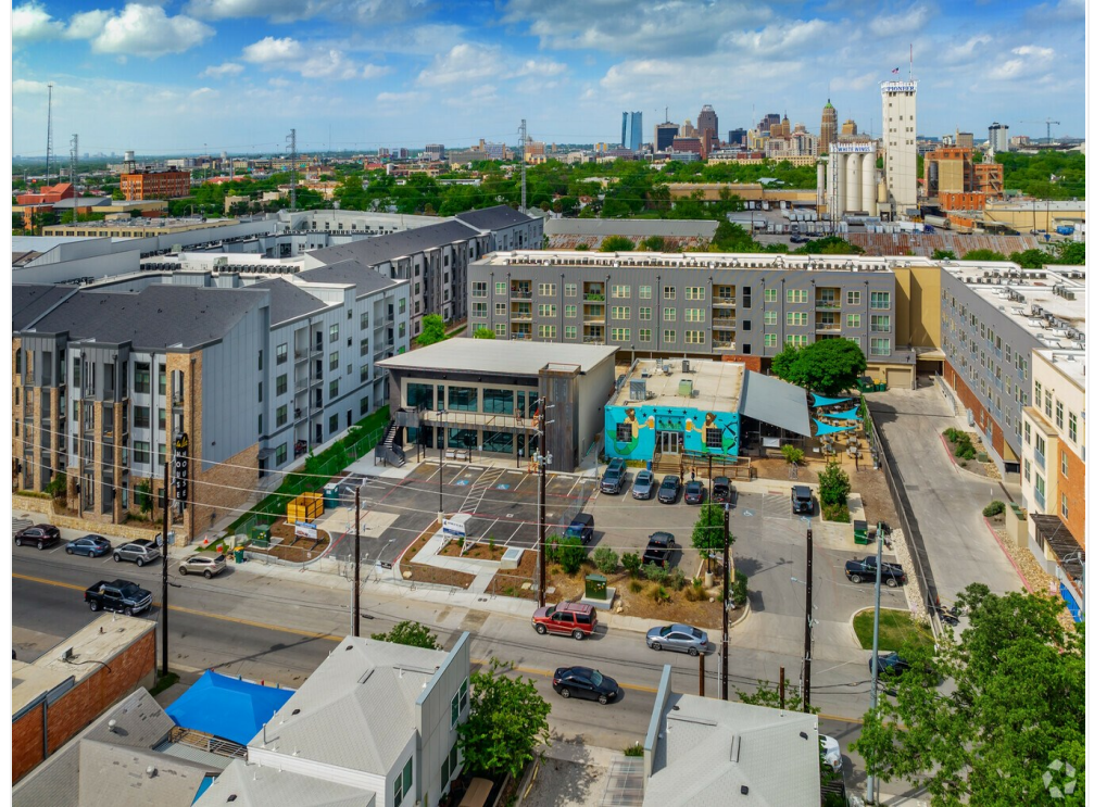
Walkable to the San Antonio River