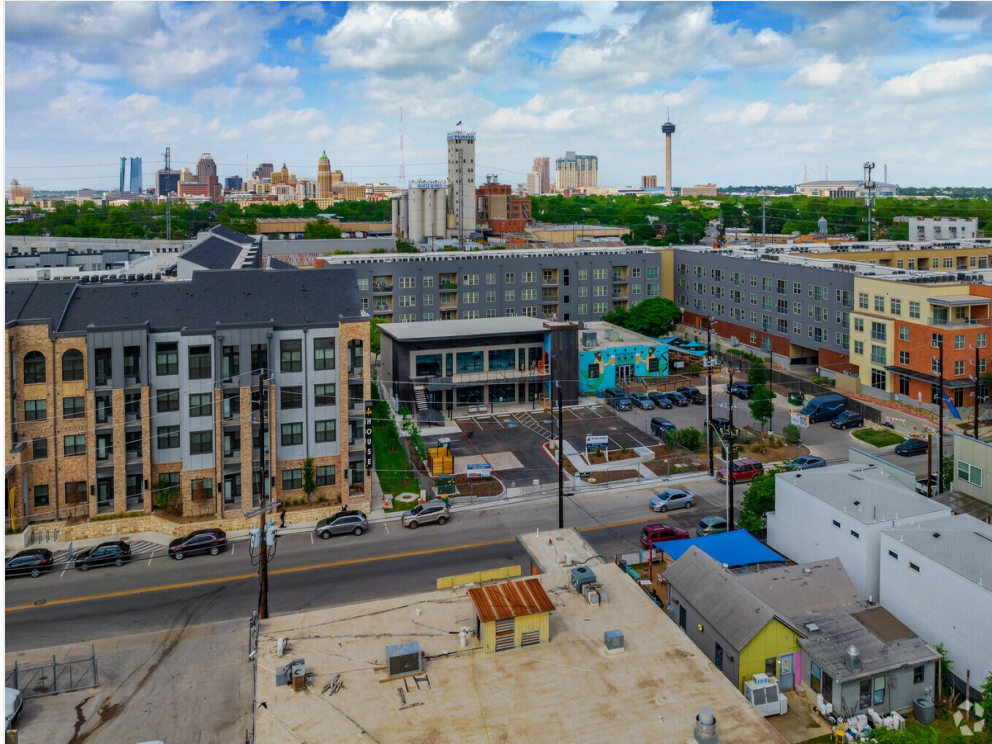
Rare Abundance of Parking in this Tight Node