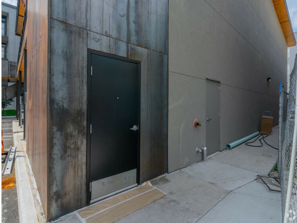
In the Heart of the Lone Star District