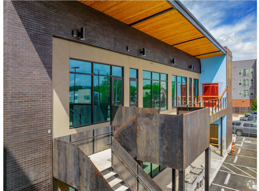
Prominent Signage Opportunities on Both Floors