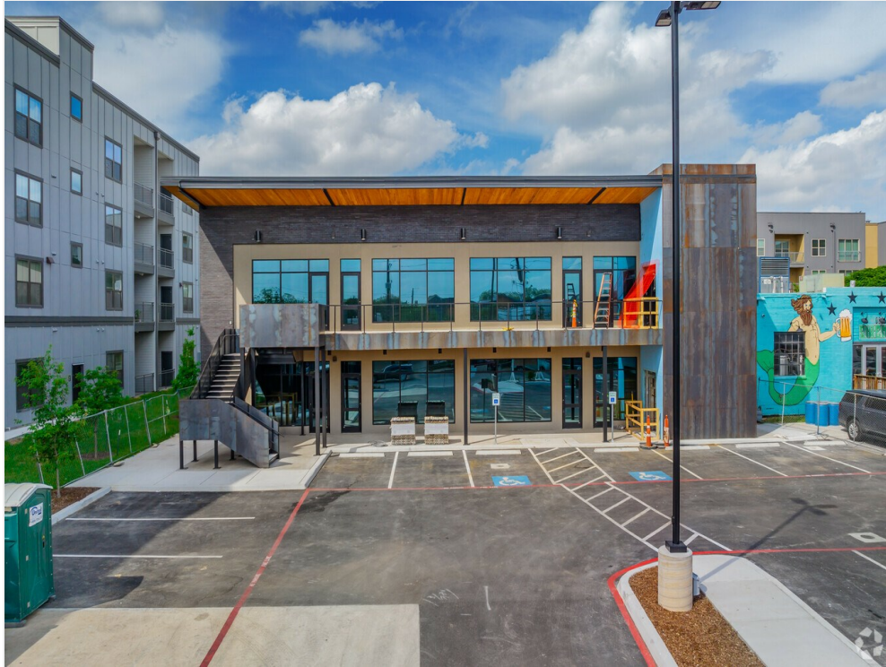
Tenants Include Cocktail Bars and a Specialty Bakery