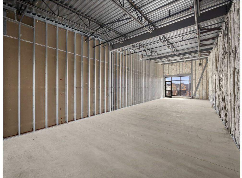
227 E Cevallos