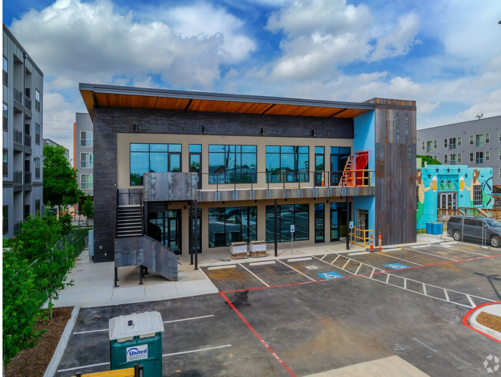
Chic Retail Hub