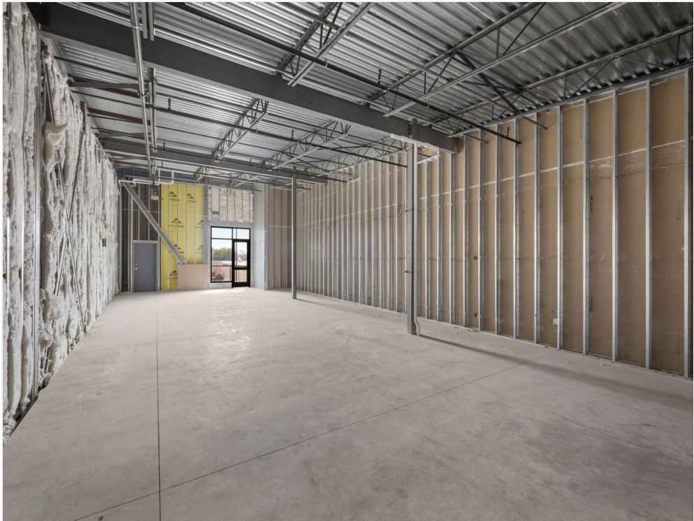
227 E Cevallos