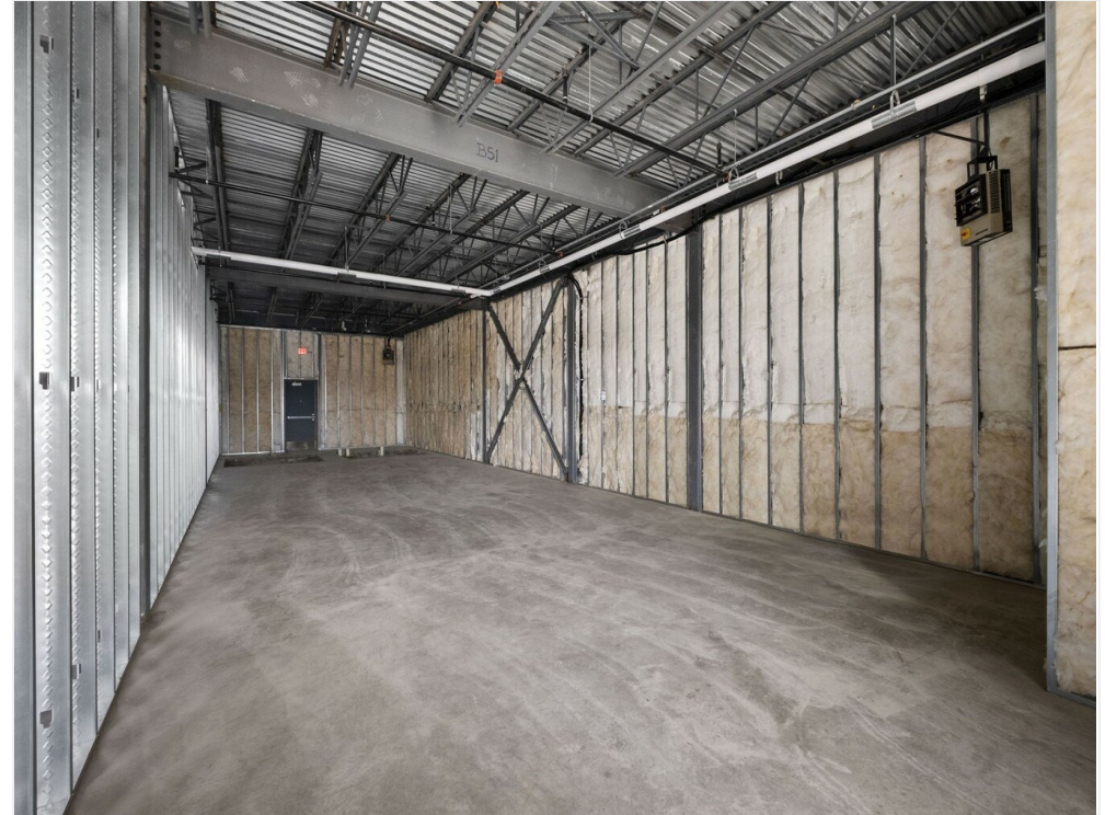
227 E Cevallos