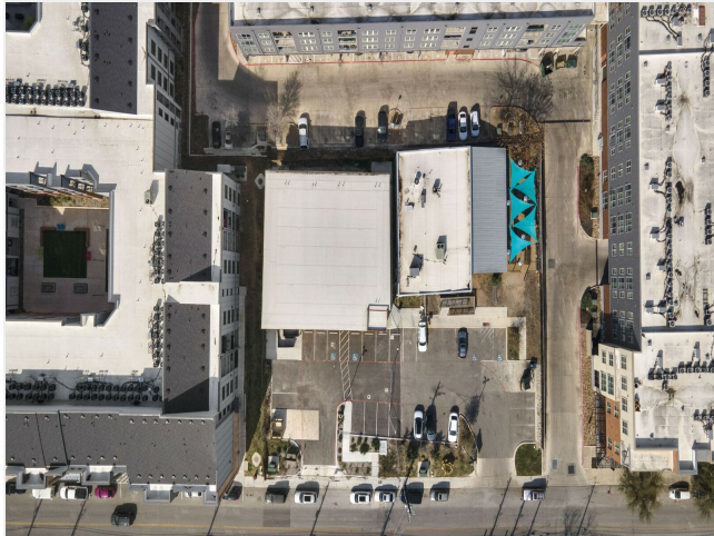
227 E Cevallos