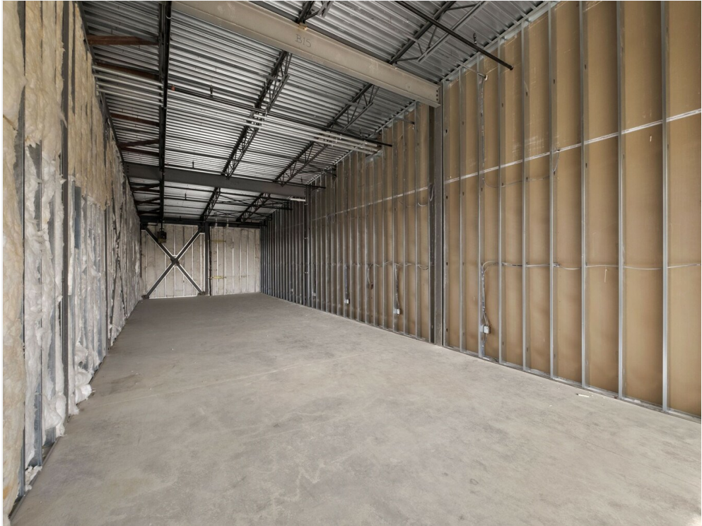
227 E Cevallos