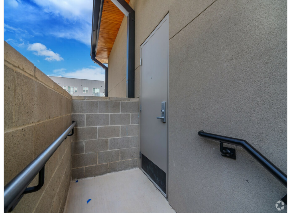
Tapped into an Affluent and Energetic Consumer Pool