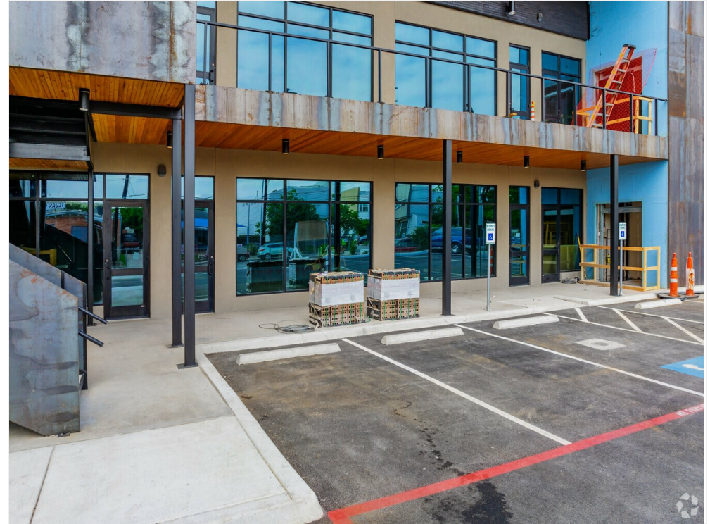
In the Heart of the Lone Star District