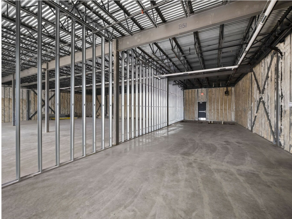
227 E Cevallos