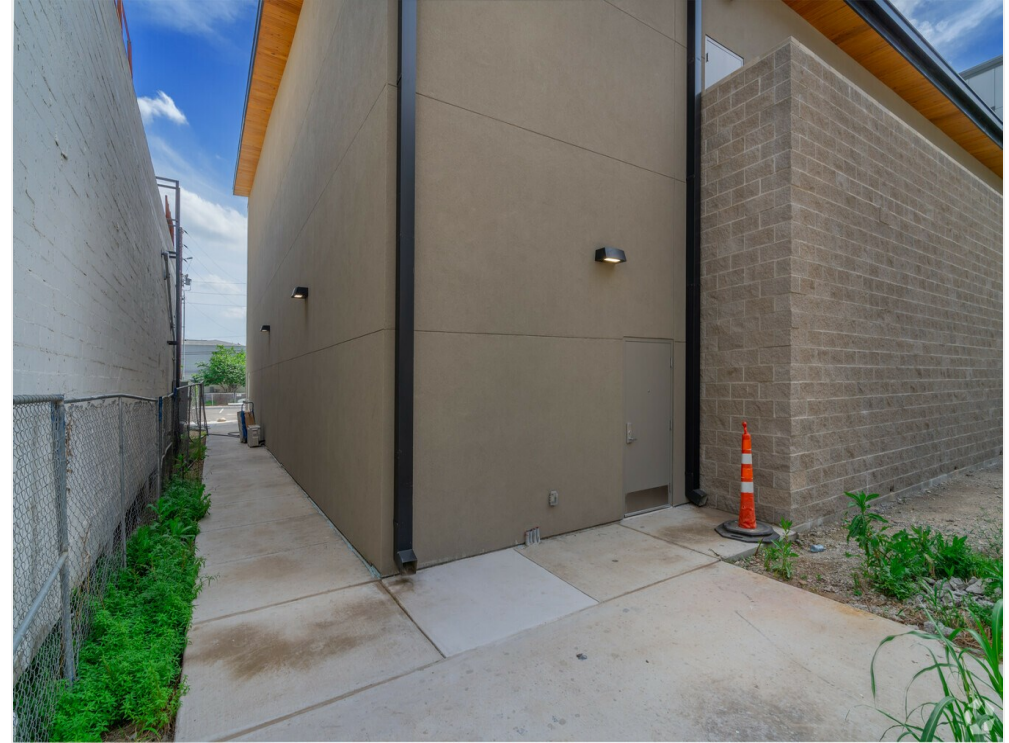
Tenants Include Cocktail Bars and a Specialty Bakery