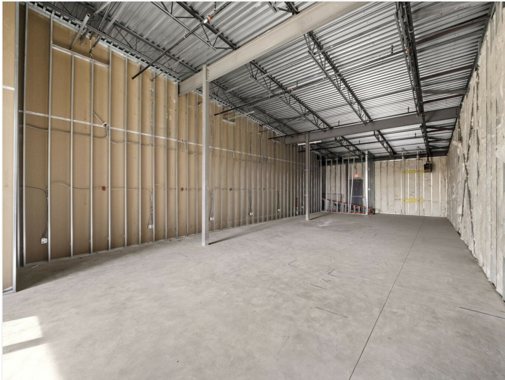
227 E Cevallos