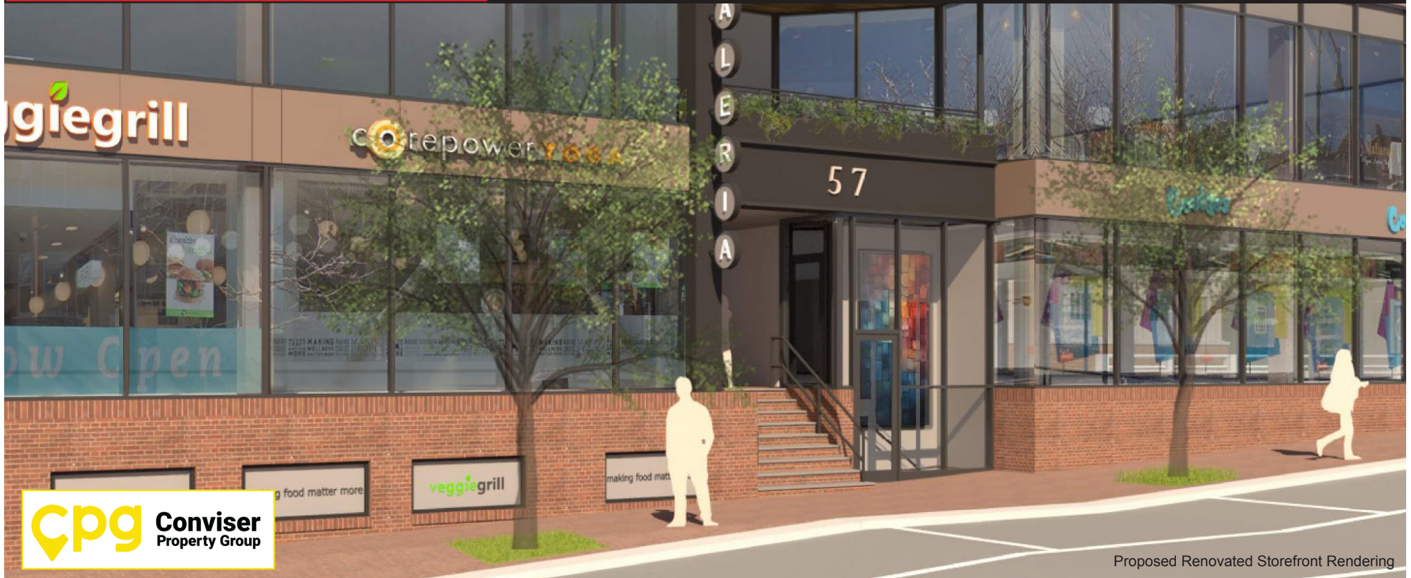
Proposed Renovated Storefront Rendering

RETAIL / RESTAURANT SPACE 57 JFK STREET - CAMBRIDGE, MA 4,602 SF LOWER LEVEL WITH DIRECT ACCESS