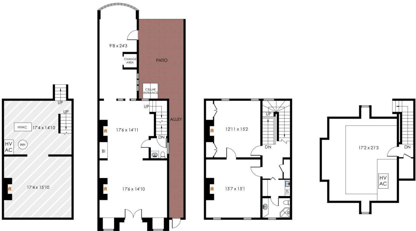
LOWER LEVEL 592 UNFIN. SQ. FT. 7' CEILING