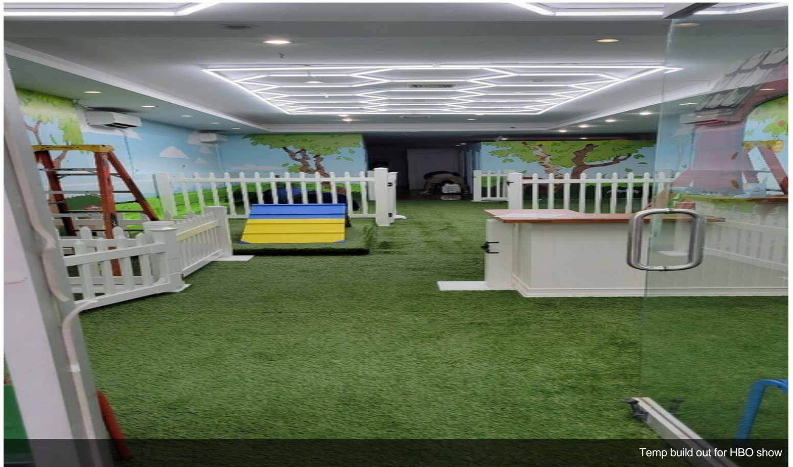
Temp build out for HBO show