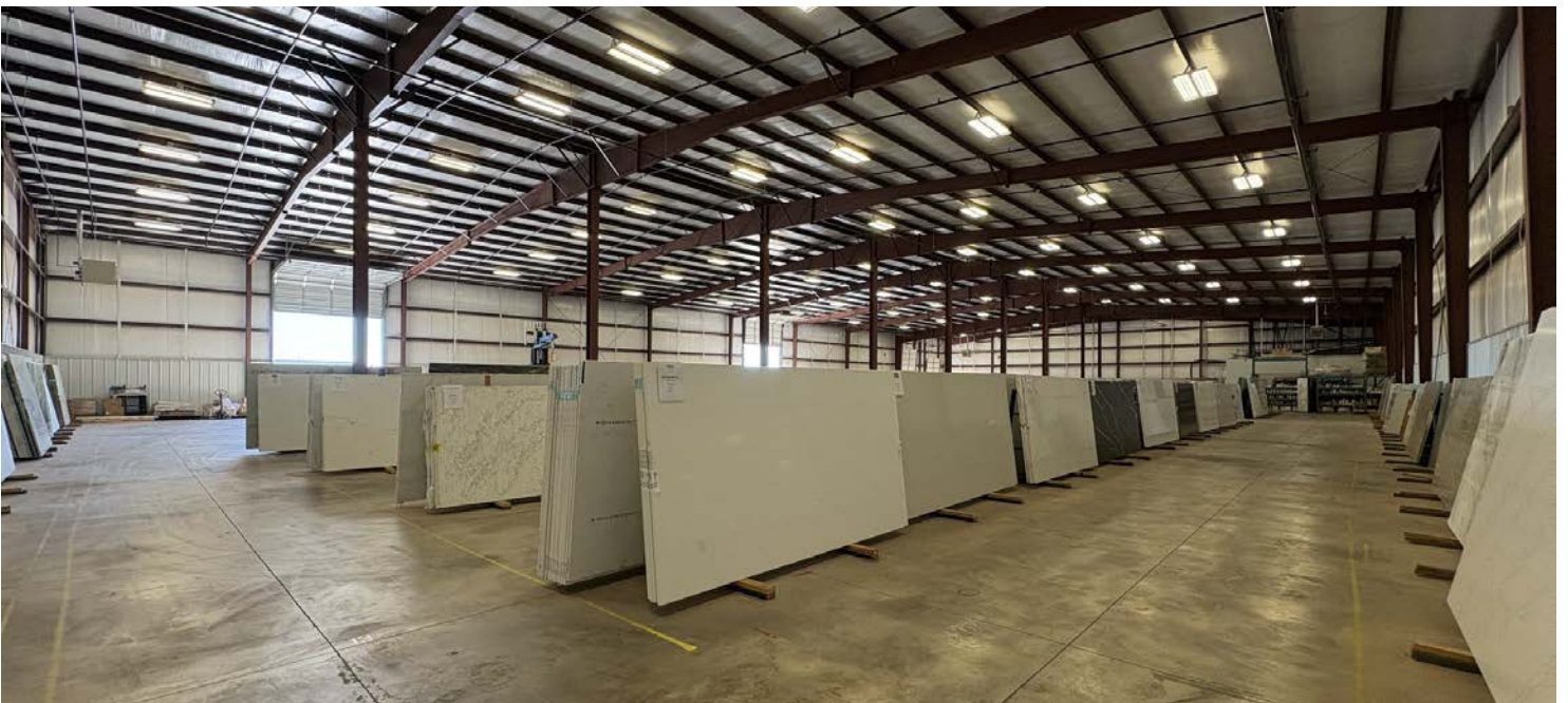
Interior of Warehouse