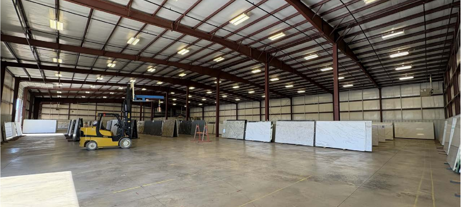
Interior of Warehouse