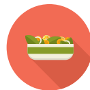
Acai & Poke Bowls