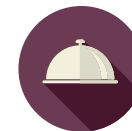
Seafood: Lobster Rolls, Surf & Turf