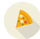
Brick Oven Pizza