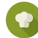
Greek-Inspired Gyros, & more!