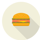
Gourmet Soups, Sandwiches & Sliders