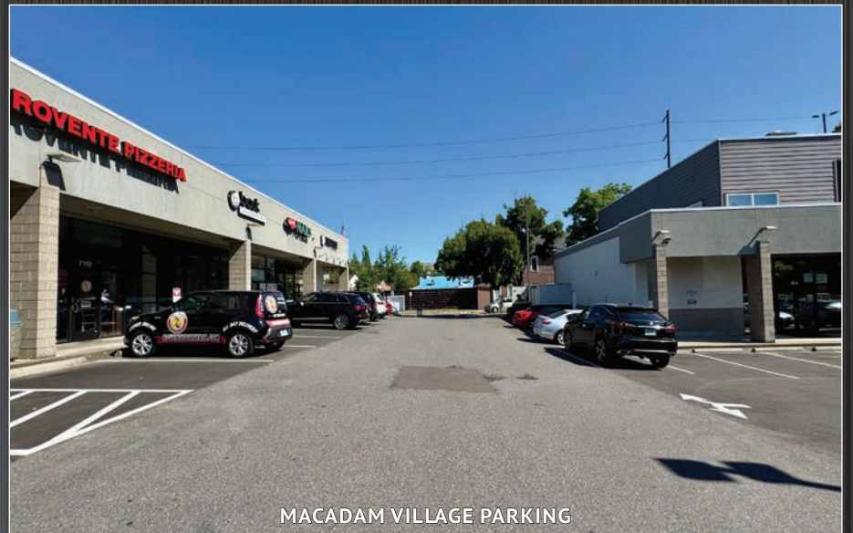
MACADAM VILLAGE PARKING