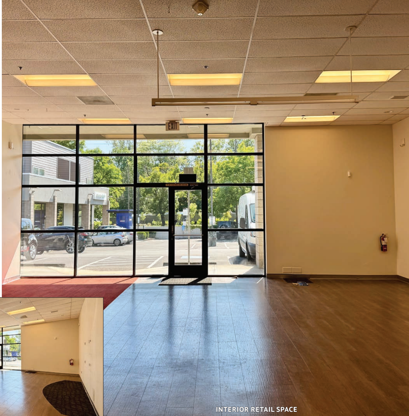
INTERIOR RETAIL SPACE