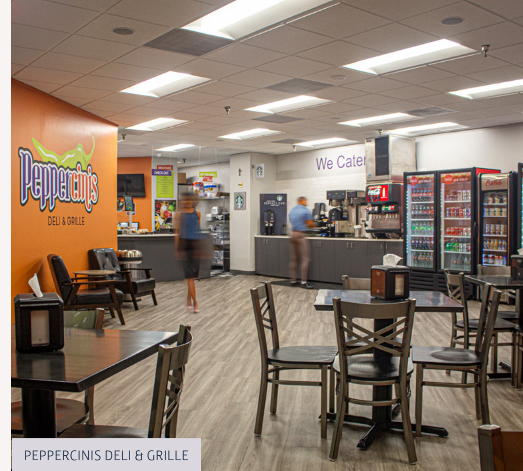
PEPPERCIN'S DELI & GRILLE