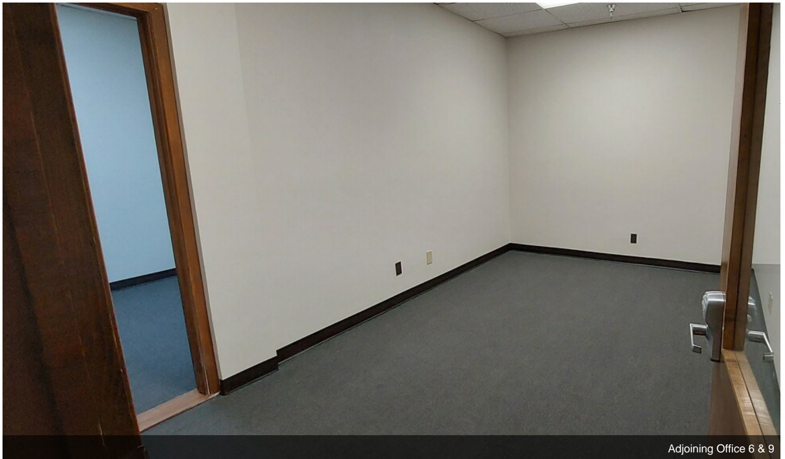
Adjoining Office 6 & 9