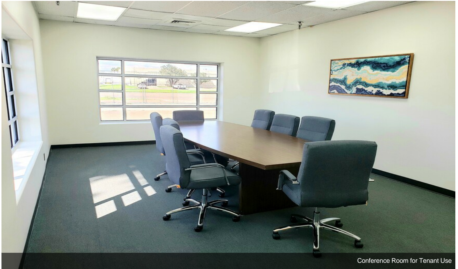
Conference Room for Tenant Use