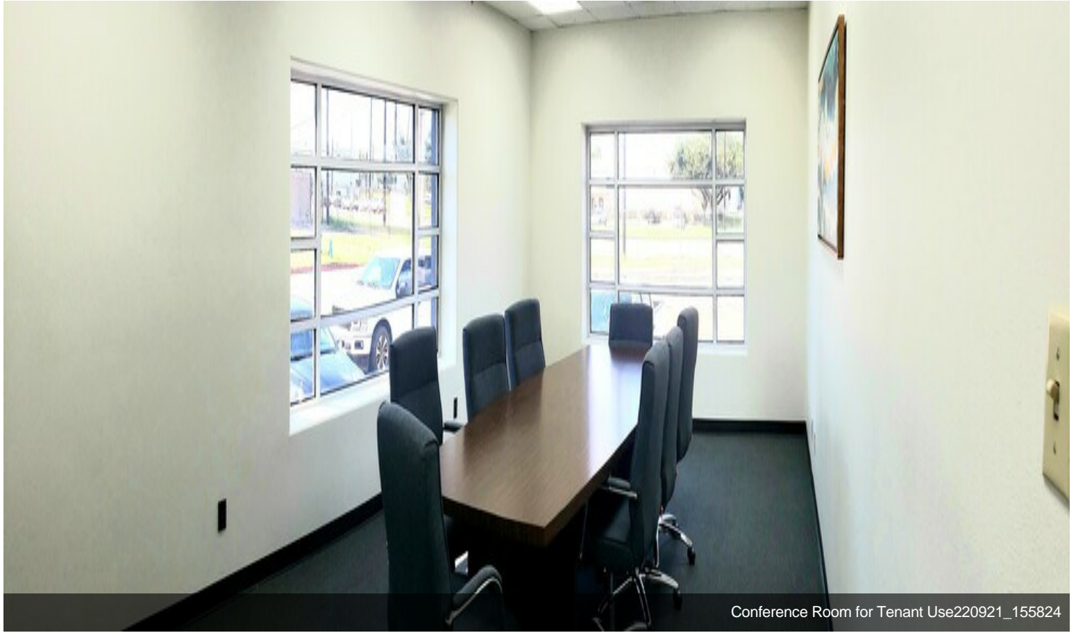
Conference Room for Tenant Use220921_155824