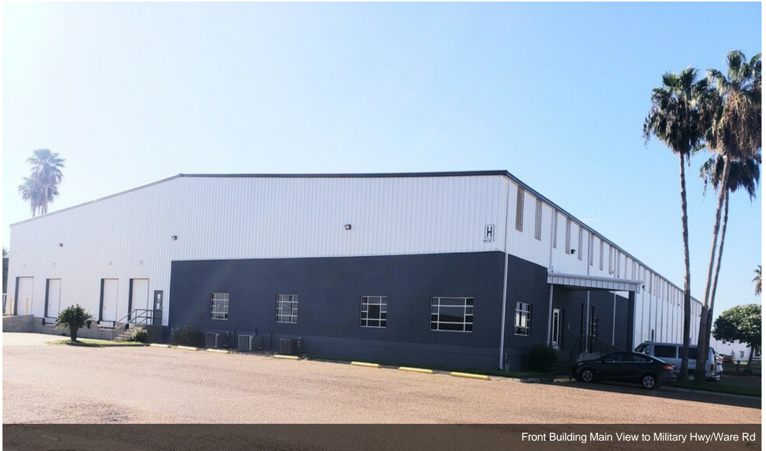
Front Building Main View to Military Hwy/Ware Rd