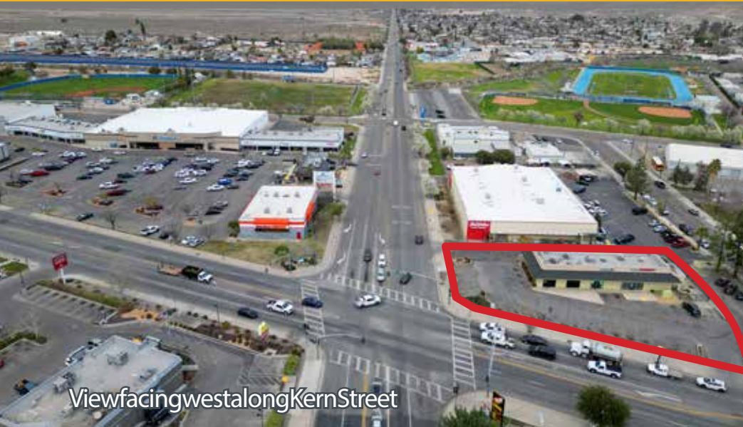
View facing west along Kern Street