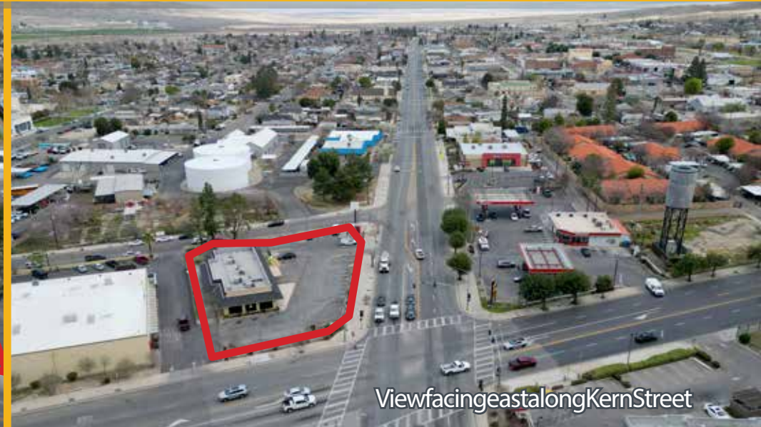
View facing east along Kern Street