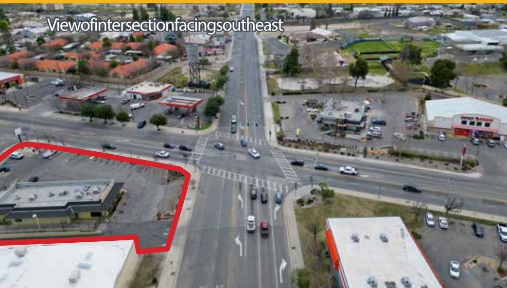
View of intersection facing southeast