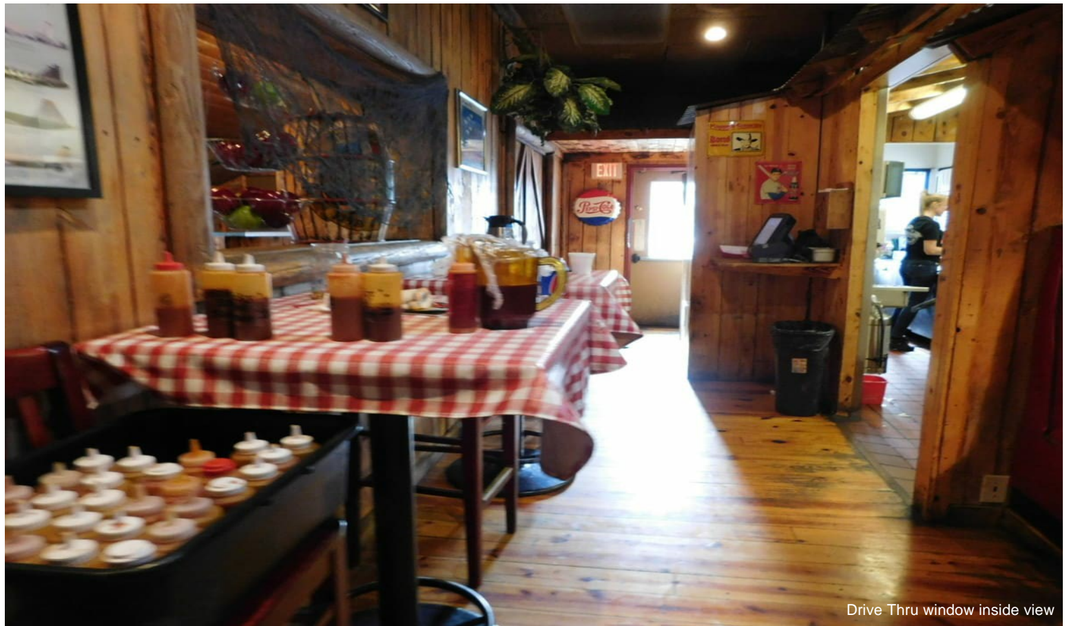
Drive Thru window inside view