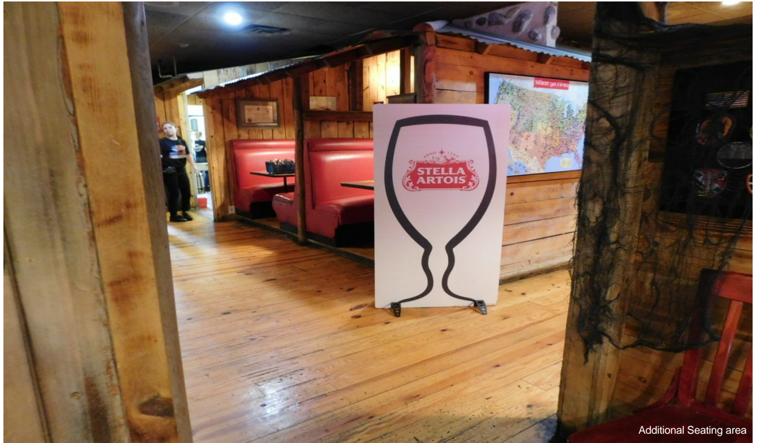
Additional Seating area