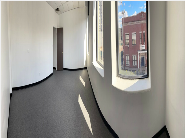
Suite 245- Window View-3