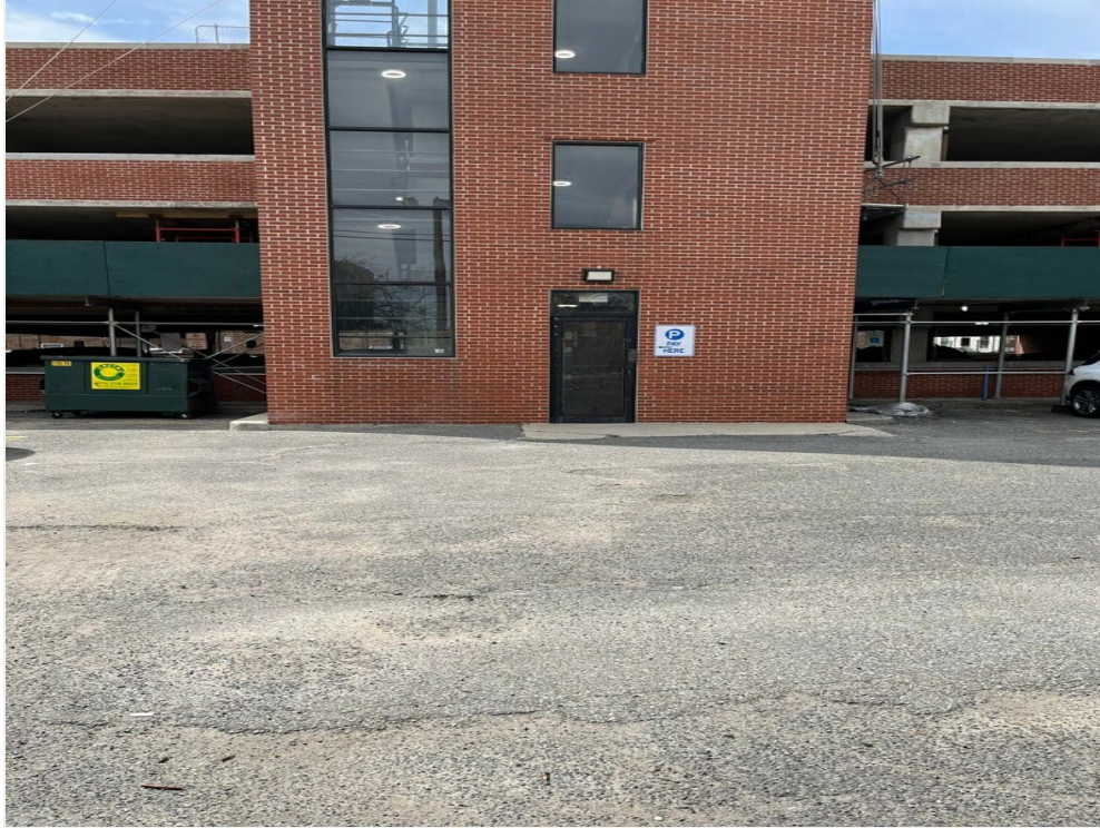
Parking garage entrance