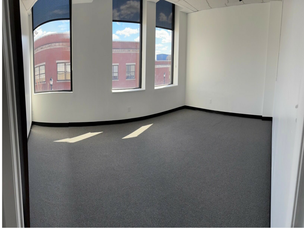
Suite 245-Window View