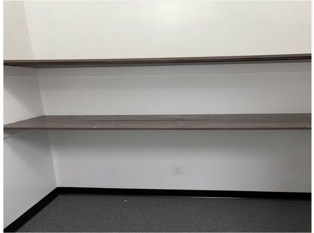
Office Closet 2