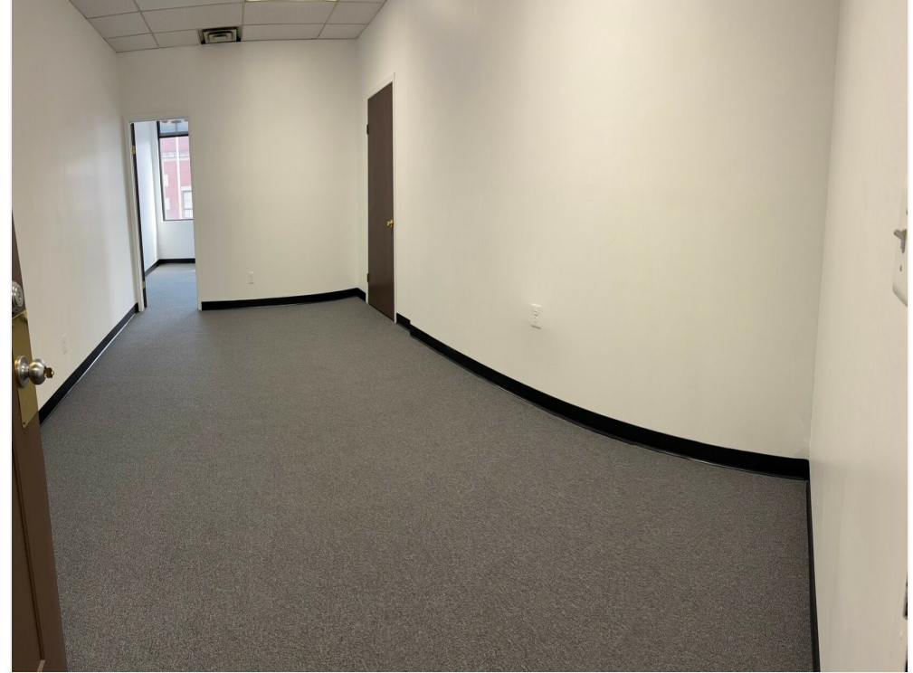
Front Office Suite 245-1