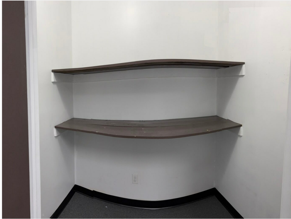
Office Closet 1