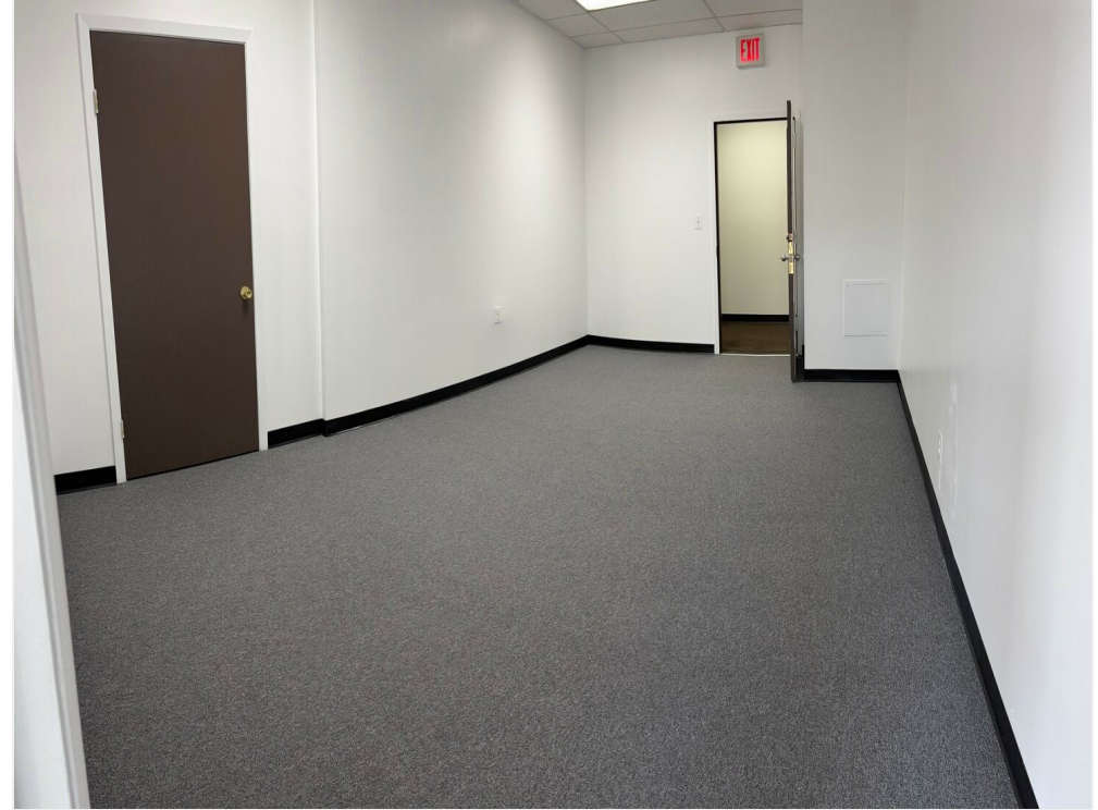
Front Office Suite 245