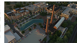
#7: UNIVERSITY CENTER $100 million, walkable mixed-use development which will include 2 hotels, multifamily housing, a sports and event center, retail, dining, and a concert venue.