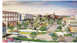
#1: RIVERWALK TOWN CENTER A collection of retail, dining, and community space. The hub of the community.