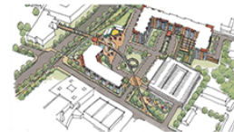
#8: ENGAGE/THE LINK 2 bridge-connected, mixed-use developments coming to Knowledge Park that will include office, retail, and multifamily housing.