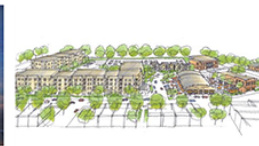
#5: EXCHANGE AT OLD TOWN DEPOT $45 million multifamily and commercial project on the site of a former car dealership.