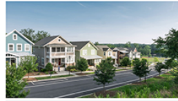
#2: RIVERWALK HOUSING A 1,008 acre master-planned community consisting of 850 homes, 250 townhomes, and 550 apartments.