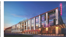
#6: THE THREAD A 400,000 SF adaptive mixed-use project built in an old textile mill.