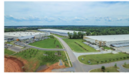
#3: RIVERWALK BUSINESS PARK A master planned business park, suitable for distribution centers and office tenants.