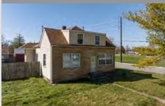
3702 Aurora St, Indianapolis, IN

2,016 SF 5 Beds, 2 Baths Occupancy - Leased 2023 - 2024 - Leased 2024 - 2025