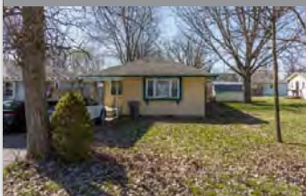
3810 S Walcott St, Indianapolis, IN

1,001 SF 3 Beds, 1 Bath Occupancy - Leased 2023 - 2024 - Leased 2024 - 2025