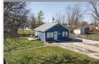
3732 Asbury St, Indianapolis, IN

552 SF 1 Bed, 1 Bath Occupancy - Leased 2023 - 2024 - Leased 2024 - 2025