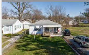
3817 S. State Ave, Indianapolis, IN

1,001 SF 3 Beds, 1 1/2 Bath Occupancy - Leased 2023 - 2024 - Leased 2024 - 2025