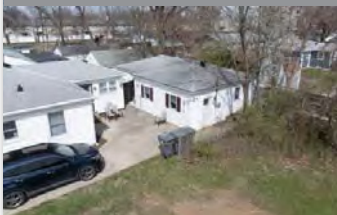
3819 S State Ave, Indianapolis, IN

920 SF 2 Beds, 1 Bath Occupancy - Leased 2023 - 2024 - Leased 2024 - 2025