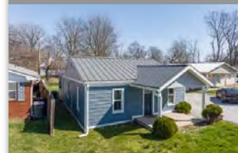
3933 S Walcott St, Indianapolis, IN

1,050 SF 3 Beds, 1 Bath Occupancy - Leased 2023-2024 - Leased 2024-2025