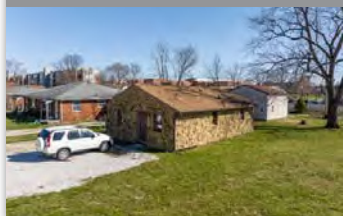
1141 Standish Ave, Indianapolis, IN

851 SF 2 Beds, 1 Bath Occupancy - Leased 2023 - 2024 - Leased 2024 - 2025