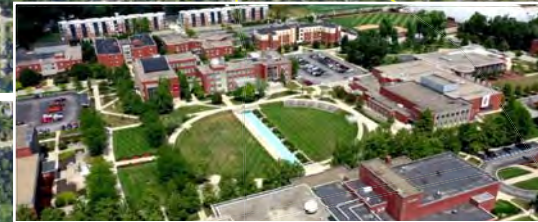
University of Indianapolis Blocks Away