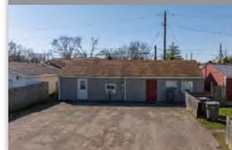
3704 Aurora St, Indianapolis, IN

920 SF 2 Beds, 1 Bath Occupancy - Leased 2023 - 2024 - Leased 2024 - 2025