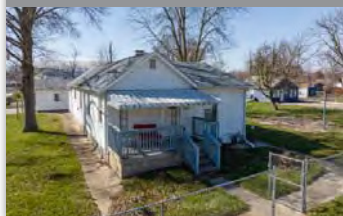
3740 Asbury St, Indianapolis, IN

1,104 SF 2 Beds, 1 Bath Occupancy - Leased 2023 - 2024 - Leased 2024 - 2025