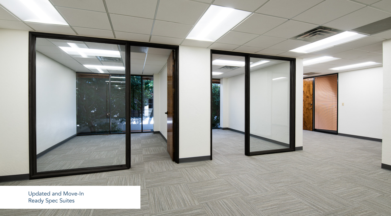
Updated and Move-In Ready Spec Suites