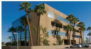
Airport 120 N 44th St Phoenix, AZ 85034