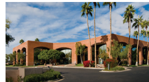
4040 4040 E Camelback Rd Phoenix, AZ 85018