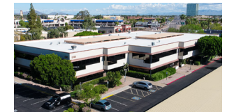
1745 & 1811 South Alma School Road Mesa, AZ 85210

Portia Dempsey Leasing & Property Management