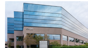
5080 5080 N 40th St Phoenix, az 85018