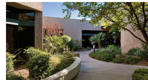
SOP 3923-4041 S McClintock Rd Tempe, AZ 85282