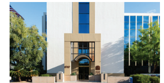
4747 4747 N 22nd St Phoenix, AZ 85016