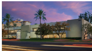
2141 2141 E Camelback Rd Phoenix, AZ 85016