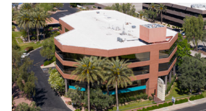
7250 N 16th Street Phoenix, AZ 85020