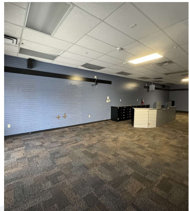
©2024 Bradley Company, LLC and affiliates. Use of any third party name or mark is for informational purposes only and does not indicate sponsorship or endorsement by such party. Not all information has been independently verified, and the presenting broker makes no guarantee about its accuracy. Any projections, opinions, or estimates are for example only. Before completing a real estate transaction, you and your advisors should conduct an independent investigation of the property to determine its suitability for your needs.