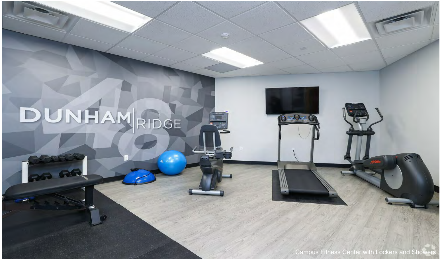
Campus Fitness Center with Lockers and Showers