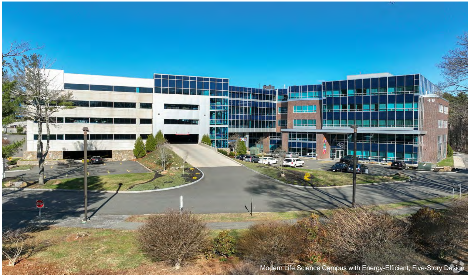
Modern Life Science Campus with Energy-Efficient, Five-Story Design