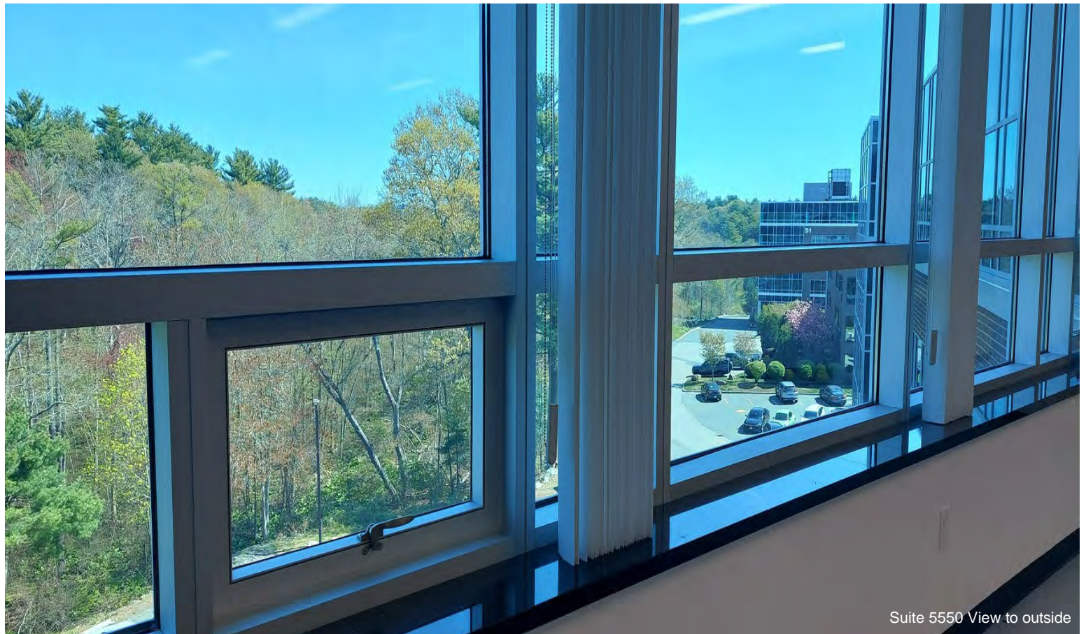
Suite 5550 View to outside