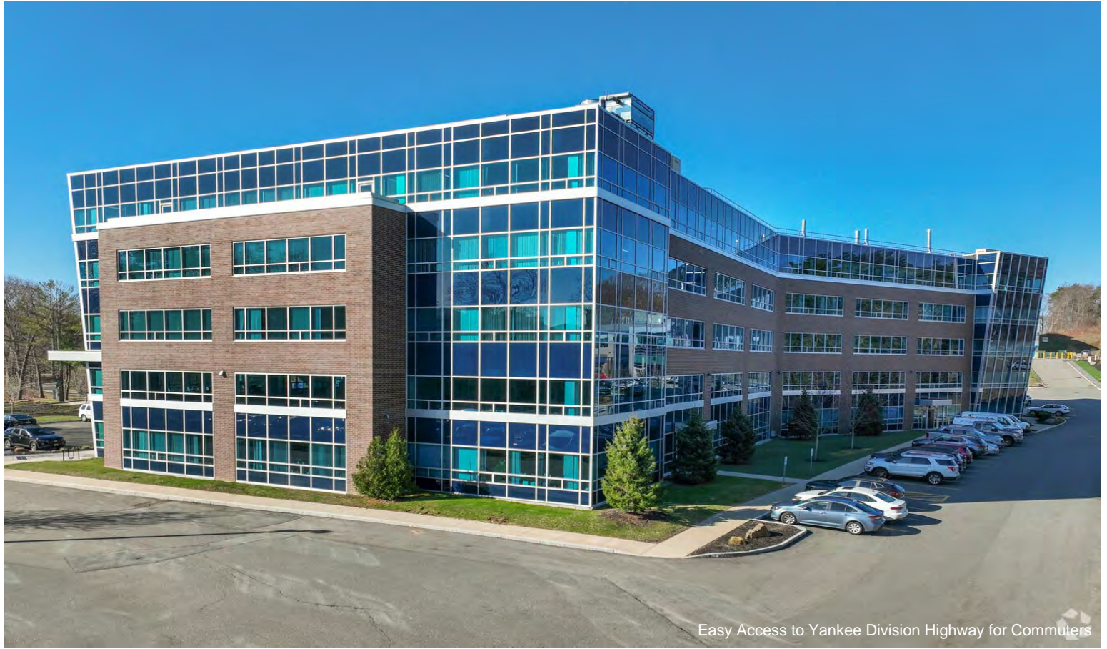
Easy Access to Yankee Division Highway for Commuters