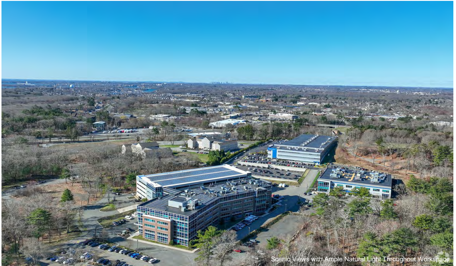
Scenic Views with Ample Natural Light Throughout Workspace