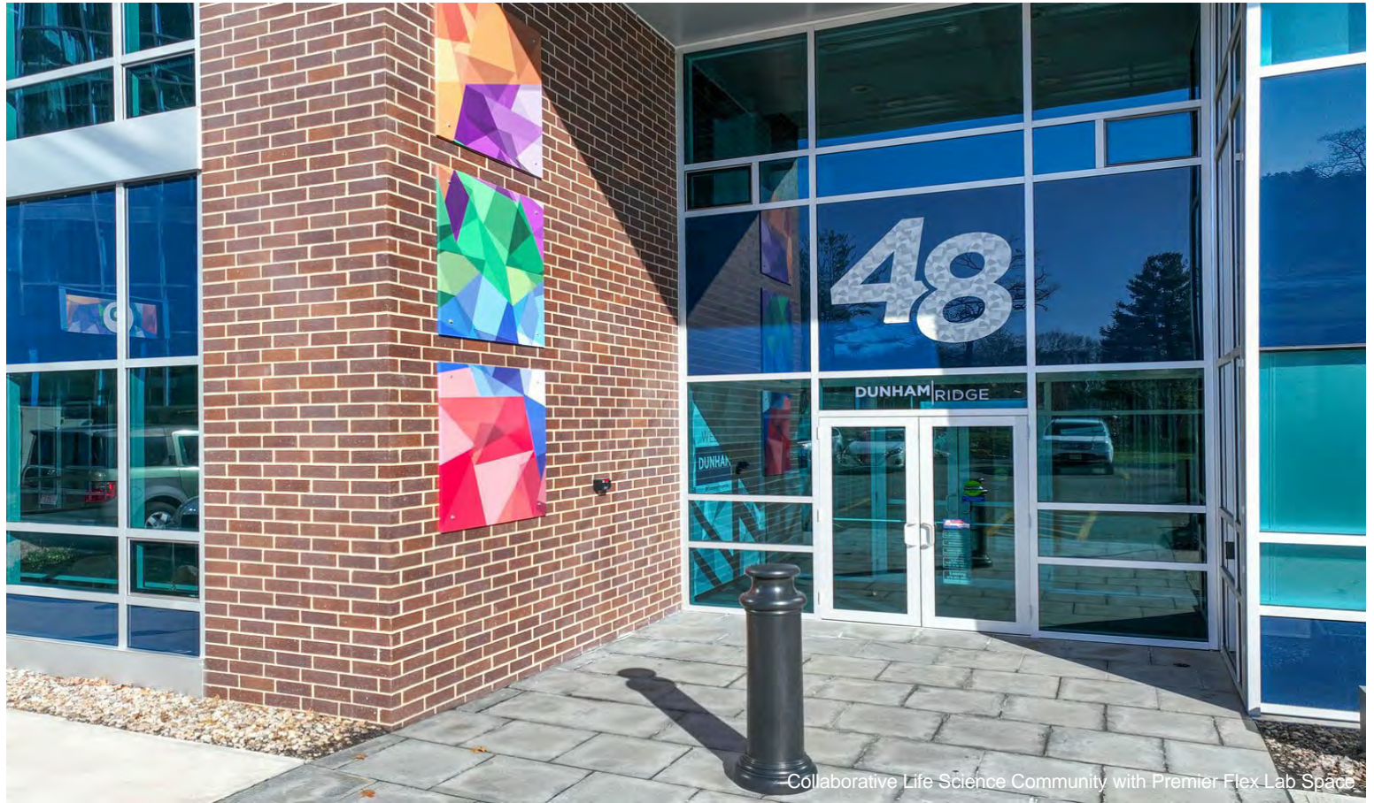
Collaborative Life Science Community with Premier Flex Lab Space