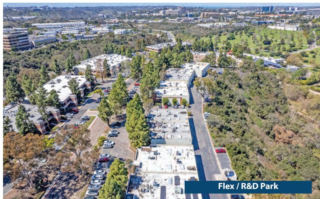
Flex / R&D Park