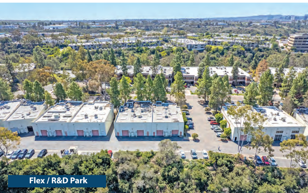
Flex / R&D Park