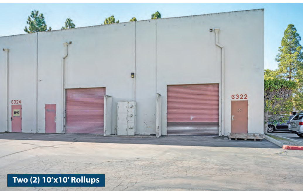
Two (2) 10'x10' Rollups