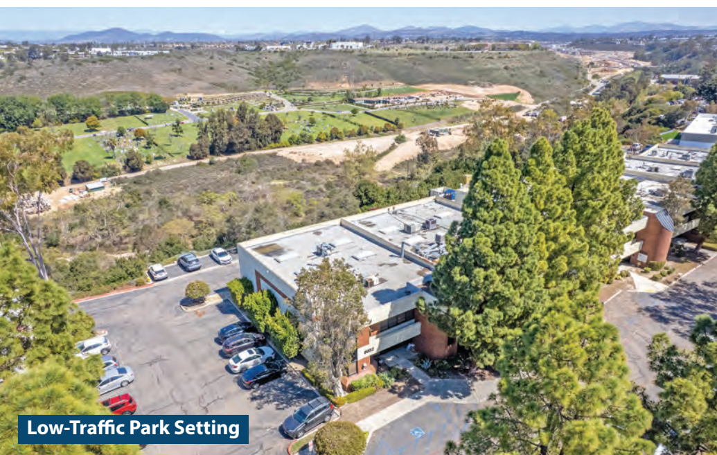
Low-Traffic Park Setting