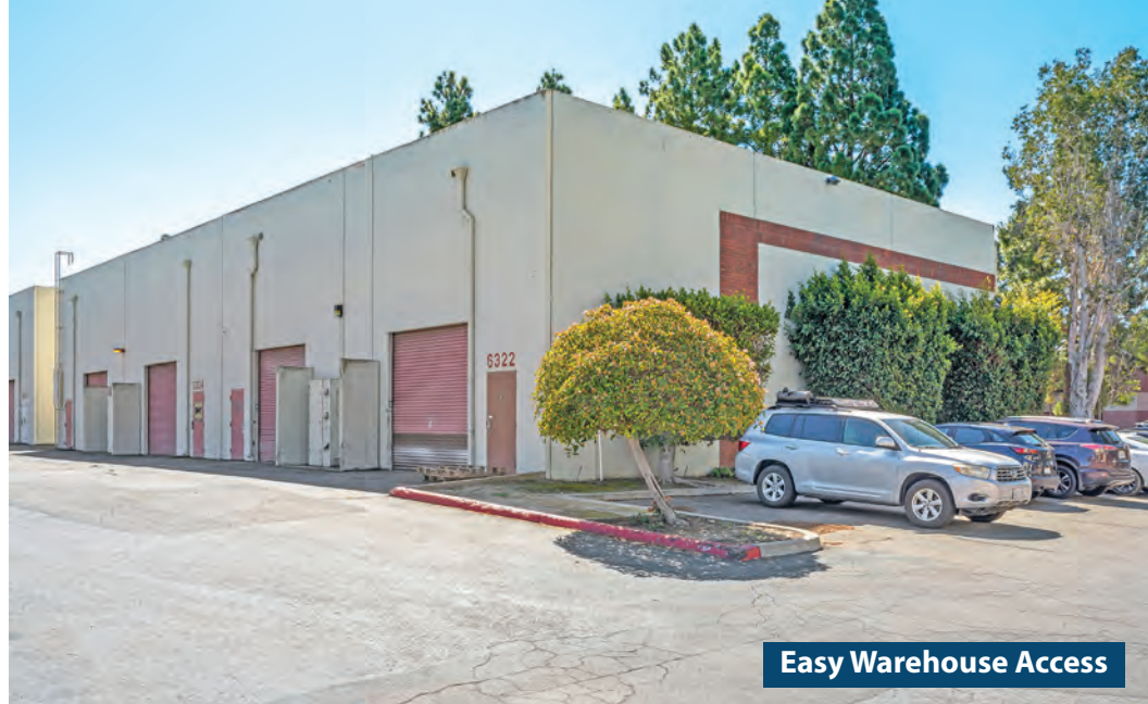
Easy Warehouse Access