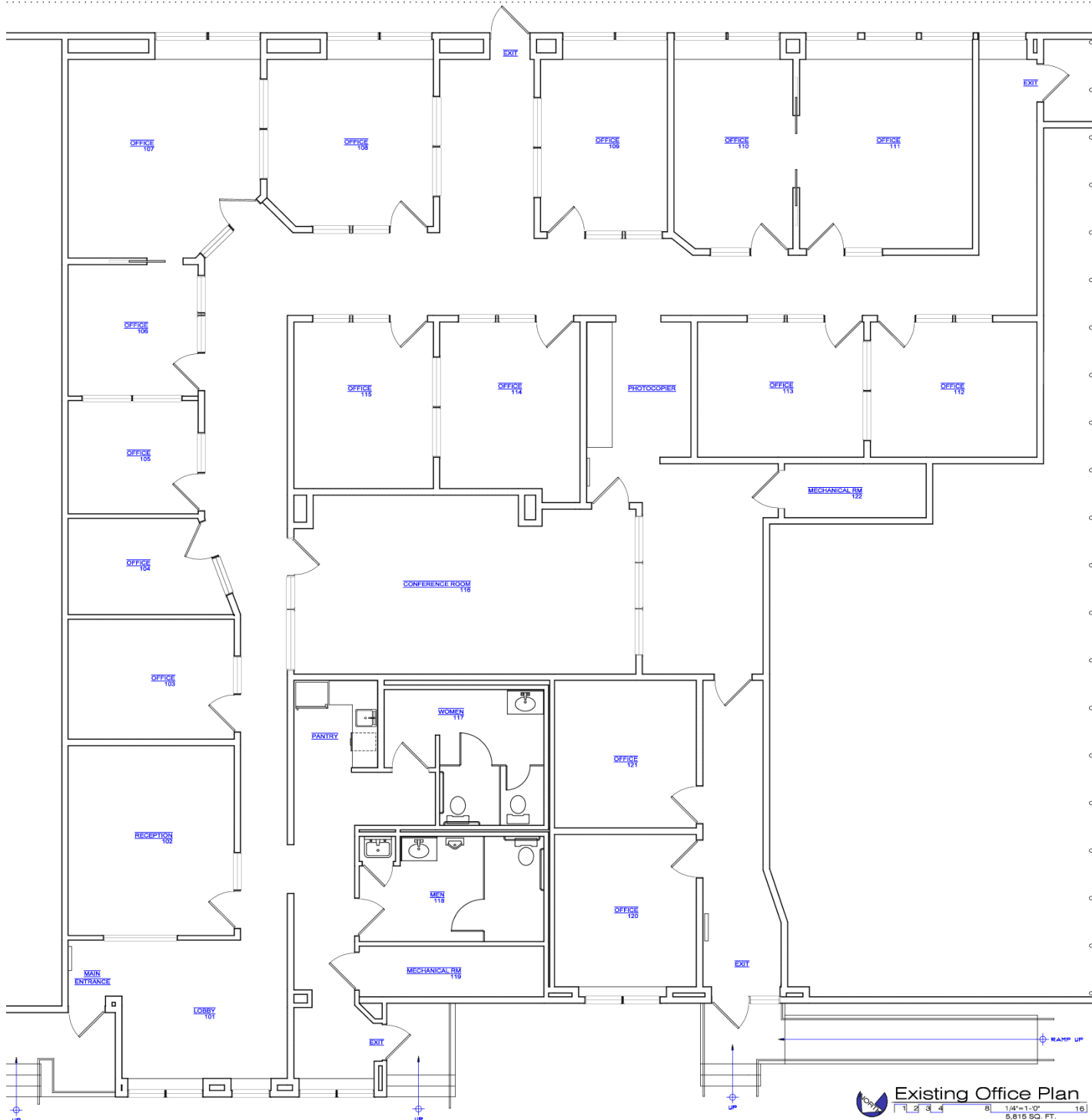
Existing Office Plan 1 2 3 4 8 1/4"=1'-0" 5,815 SQ. FT.