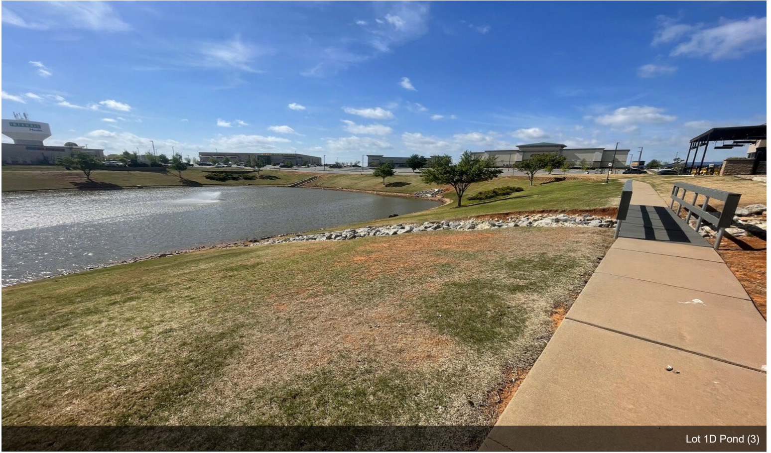
Lot 1D Pond (3)