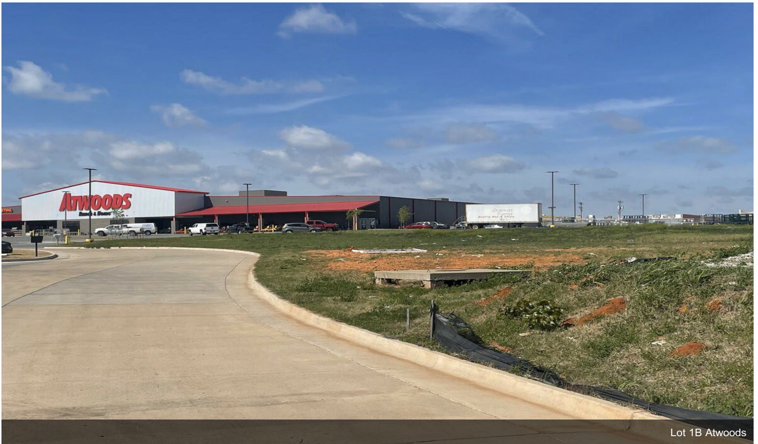
Lot 1B Atwoods