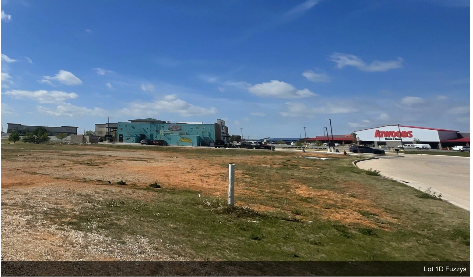
Lot 1D Fuzzys