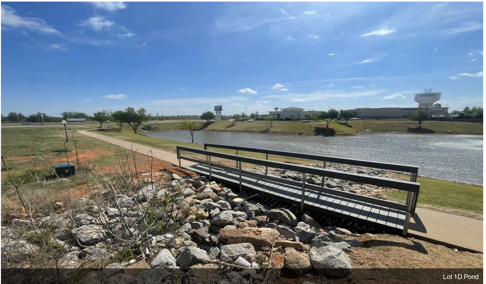
Lot 1D Pond