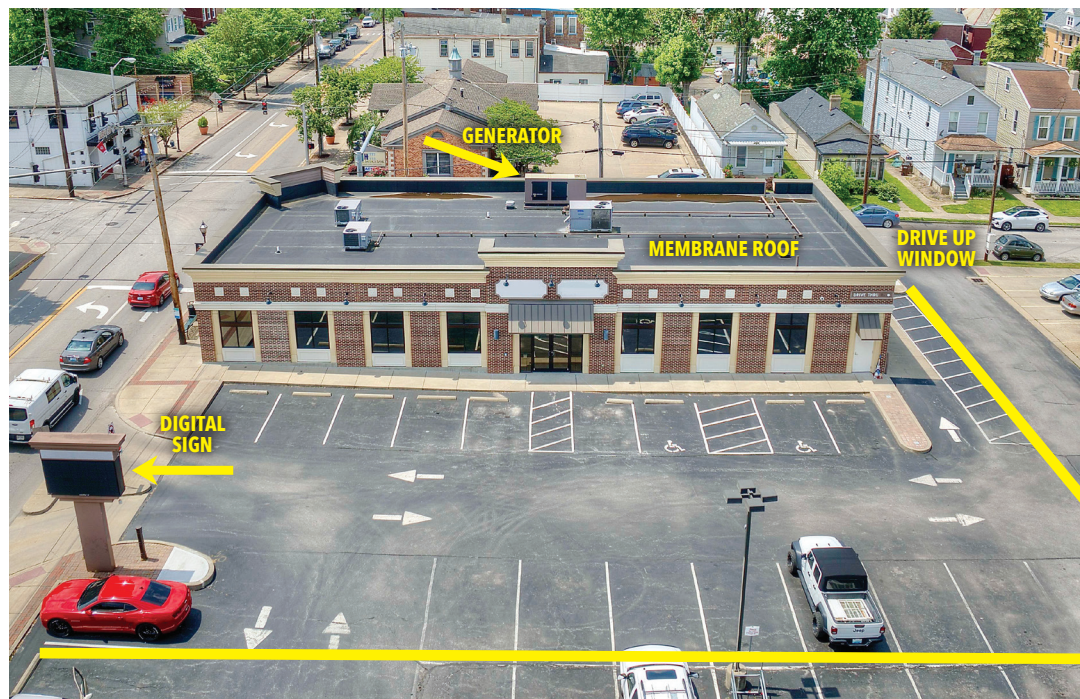
126 Elm Street, Ludlow, KY

LEASE RATE: $18.00 psf, CAM $4.95 psf estimated