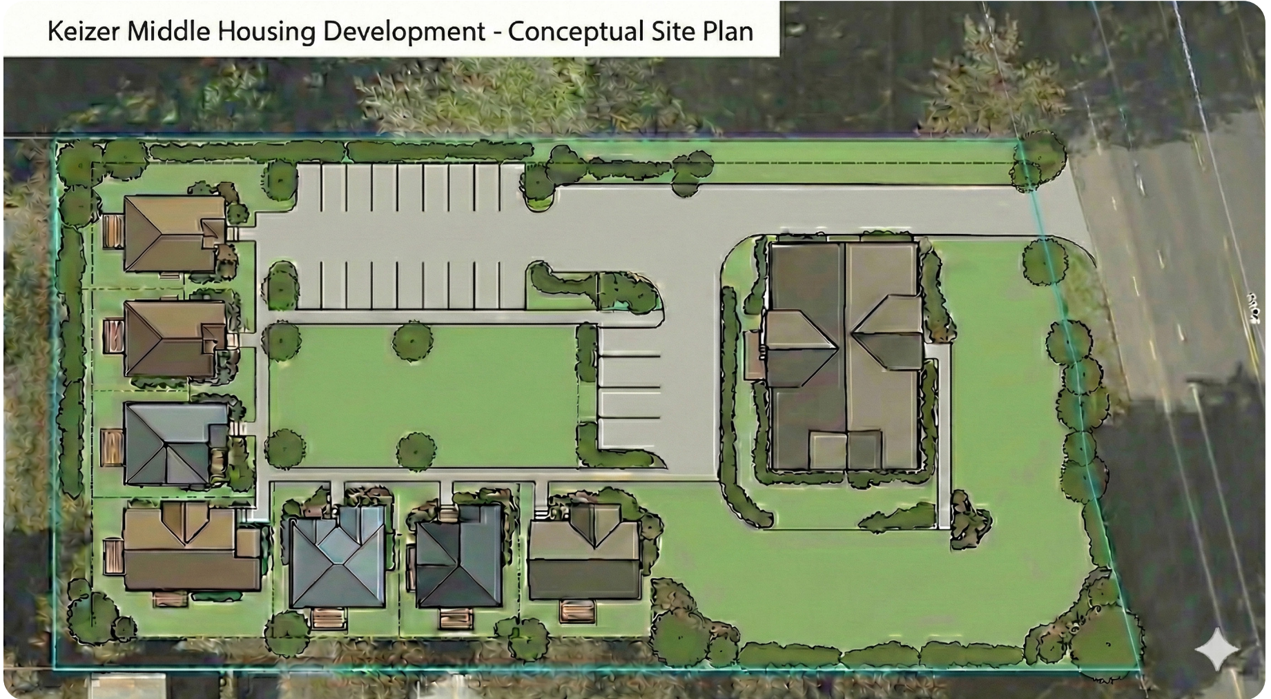
Keizer Middle Housing Development - Conceptual Site Plan

Concept plan shows potential developability as a middle housing project and has not been approved by any authorities.