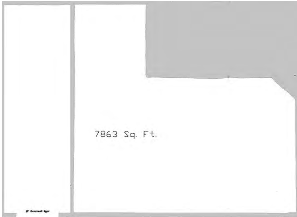
Warehouse - Floor Pan