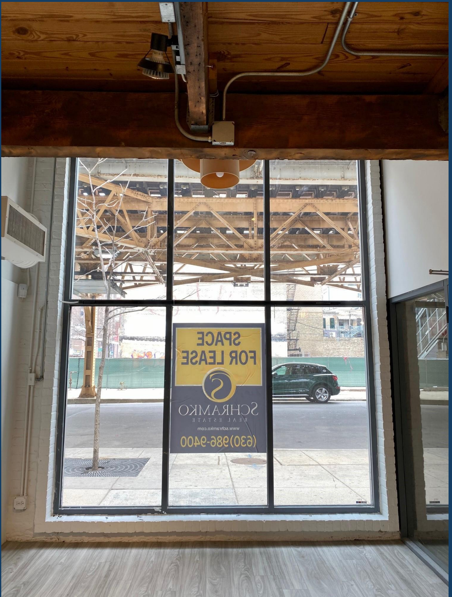
Ground Level Retail - Unit104