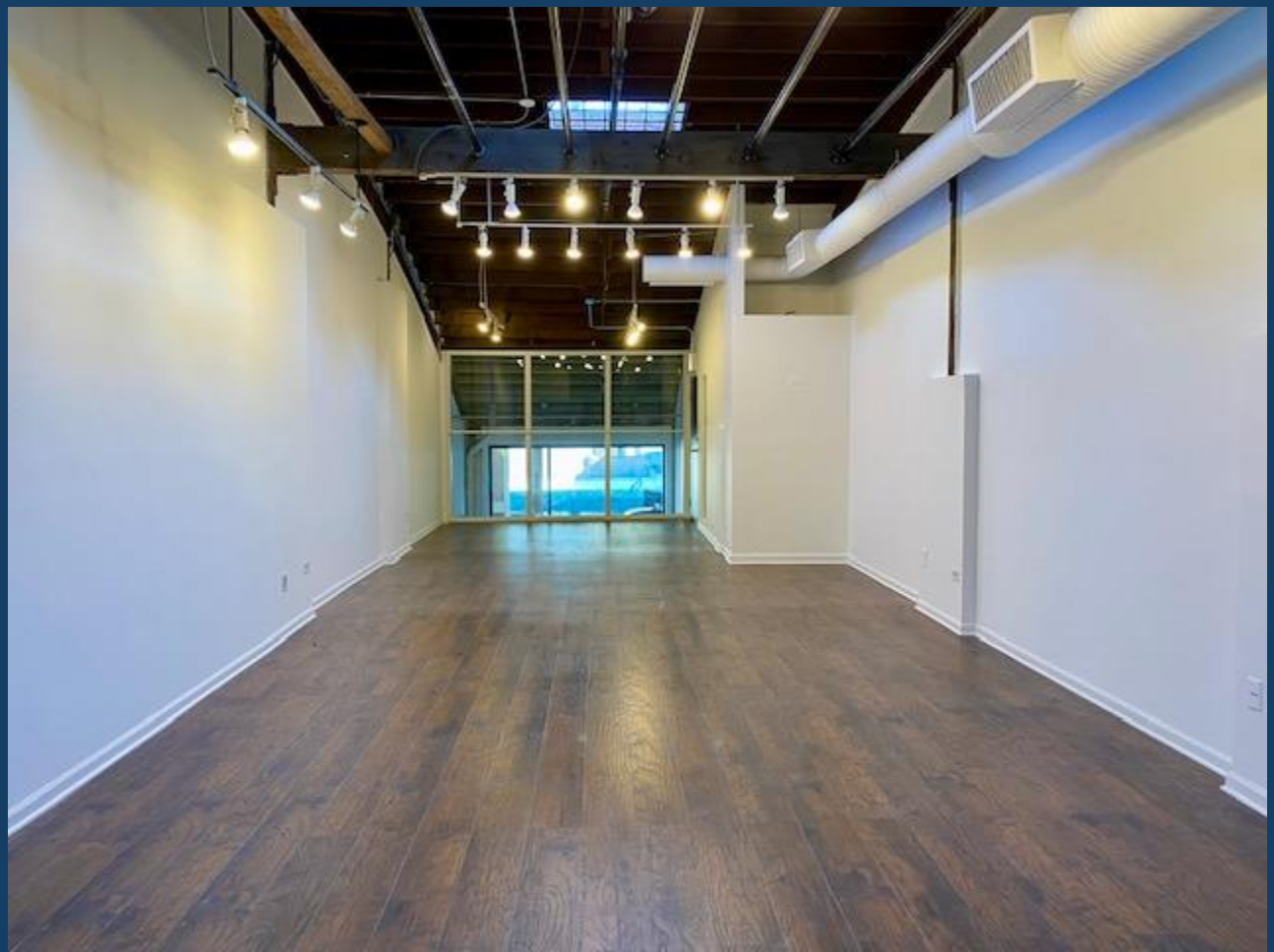
2 nd floor Commercial Space