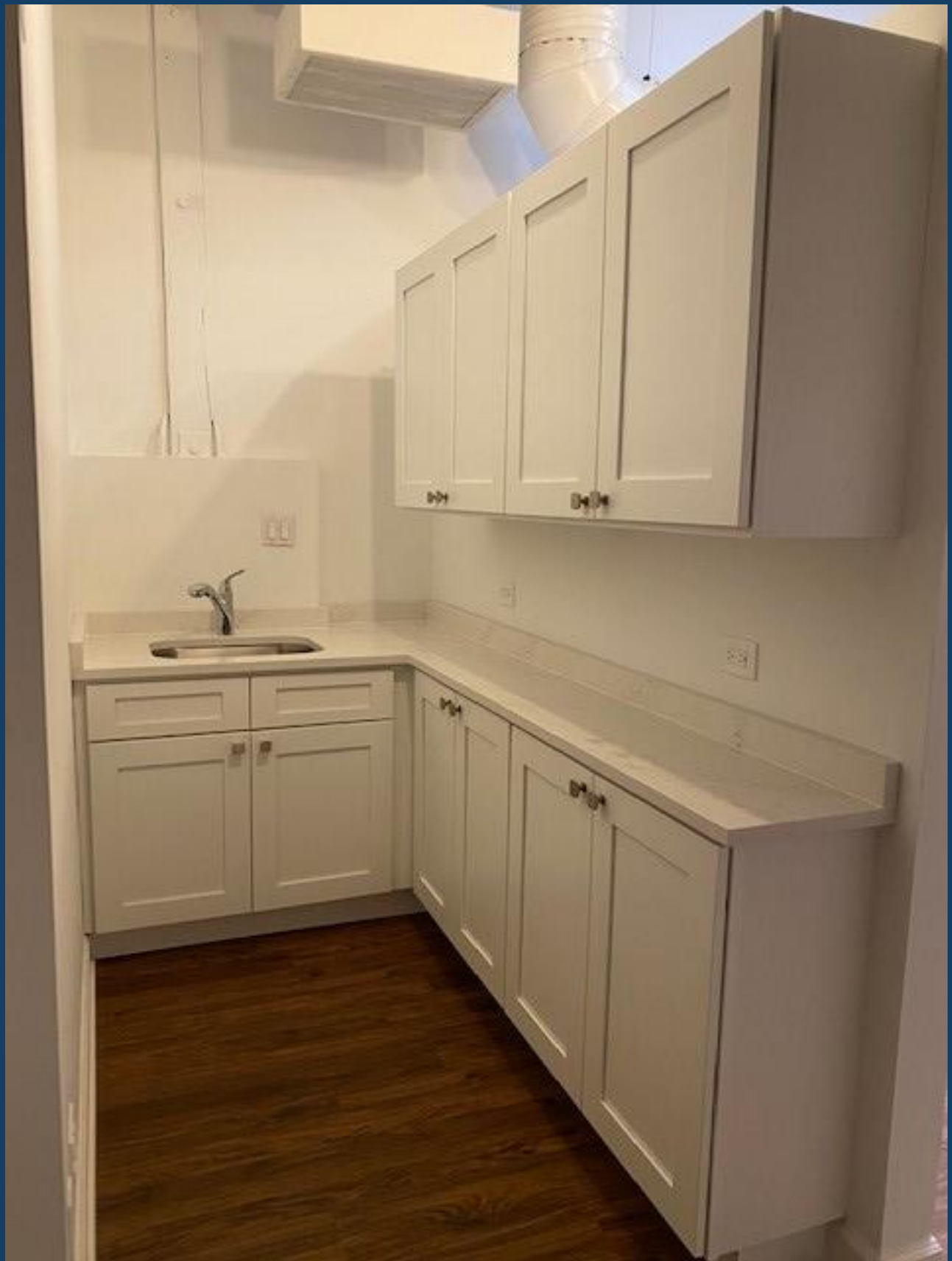
2 nd floor Commercial Space Features