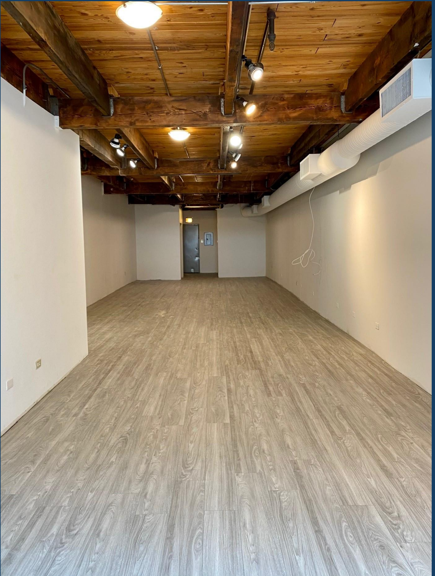
Ground Level Retail - Unit 104