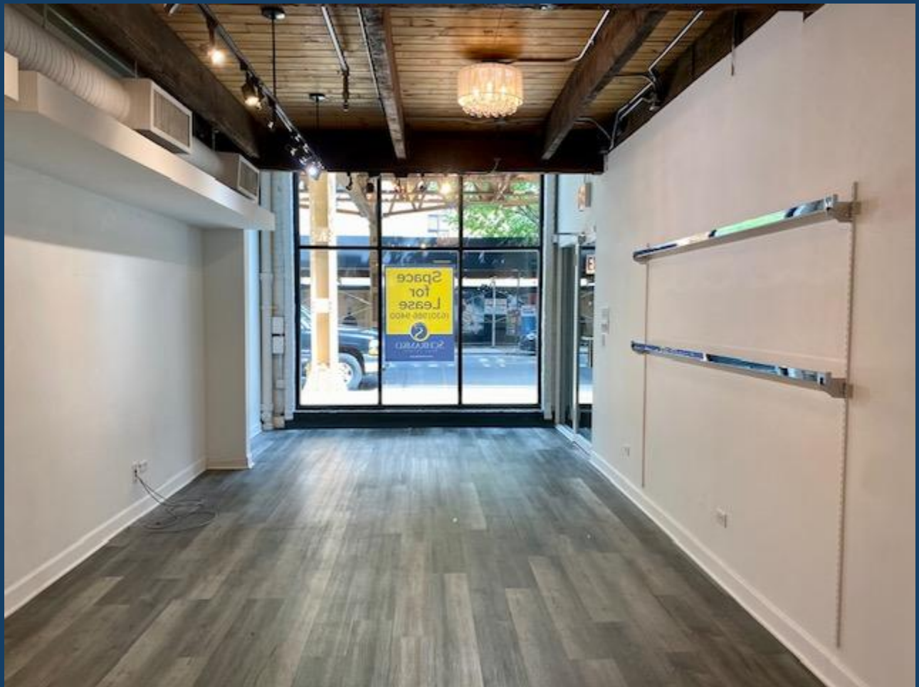
Ground Level Retail - Unit 103