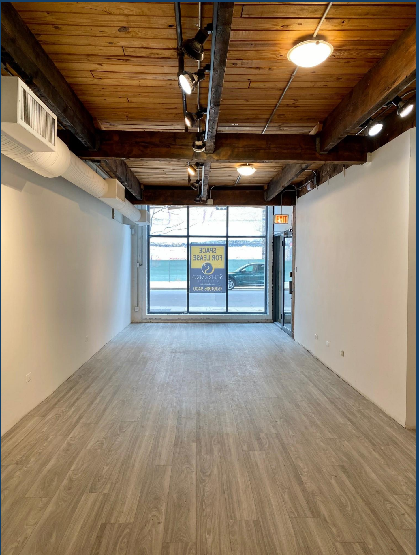
Ground Level Retail – Unit 104