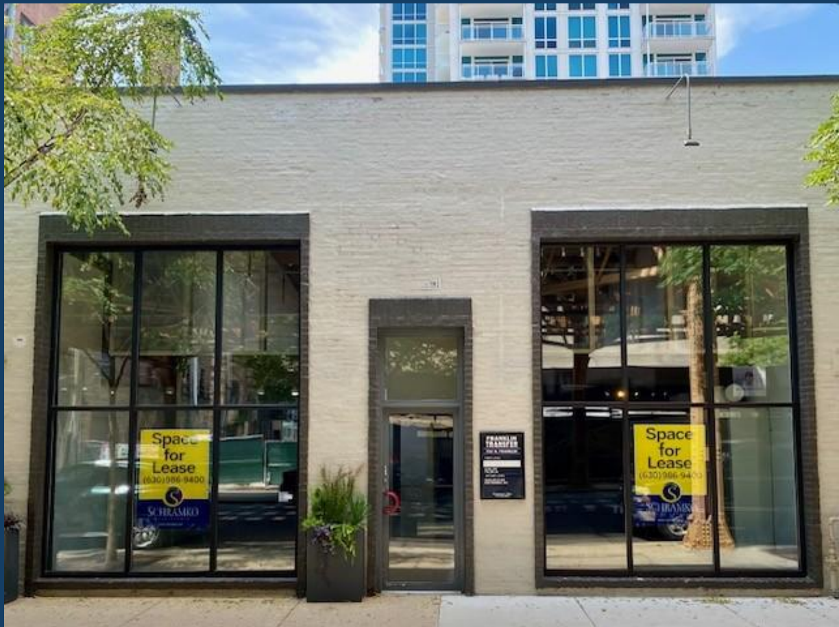
Ground Level Retail – Units 103 & 104