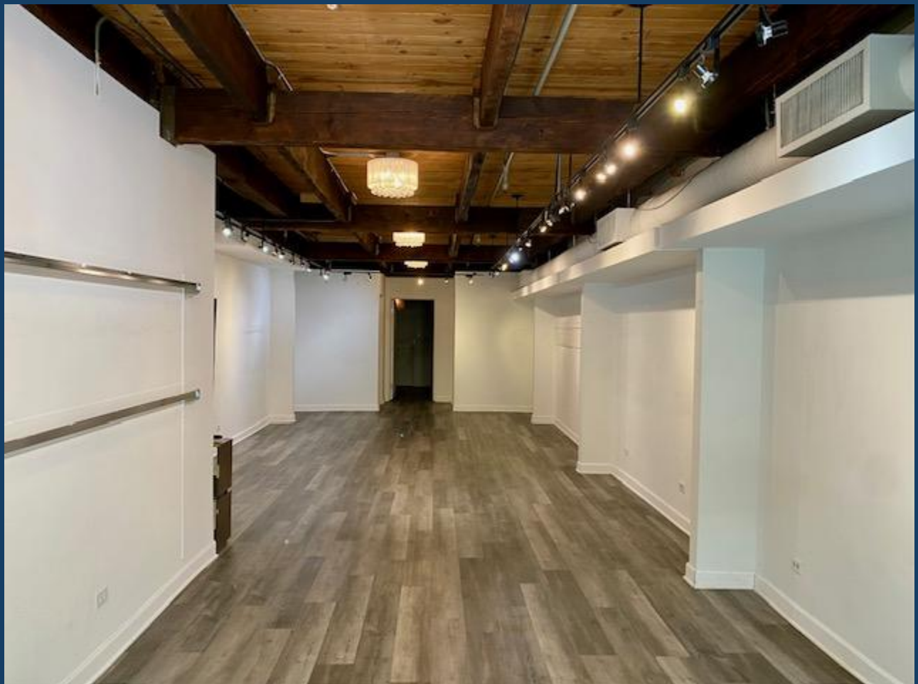
Ground Level Retail - Unit 103