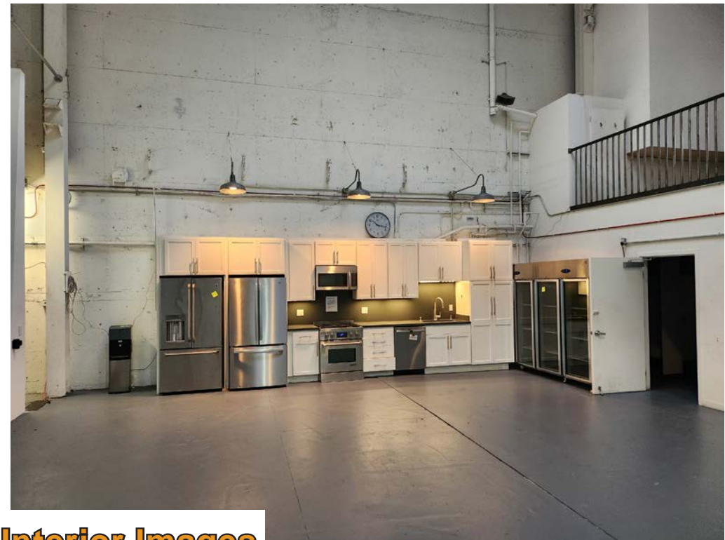
535 Minnesota Interior Images