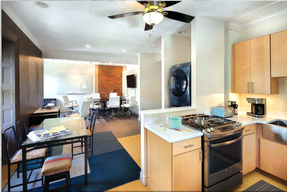
Third Floor of 1942

Entrance of startup Apollo Neuroscience—6 work here Previously an apartment with living room, kitchen and 2 large