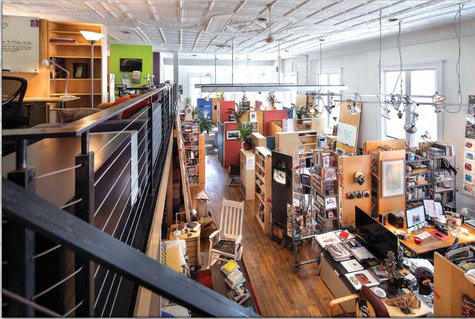
Main studio and loft