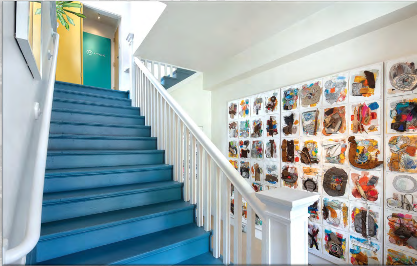
Stairway at 1942 to Moxie and Apollo with art installation