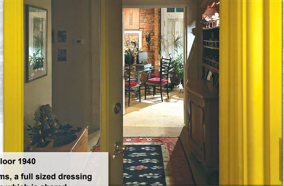
Resident Space—First Floor 1940

Currently configured as four large rooms, a full sized dressing room and pantry plus the kitchen which is shared