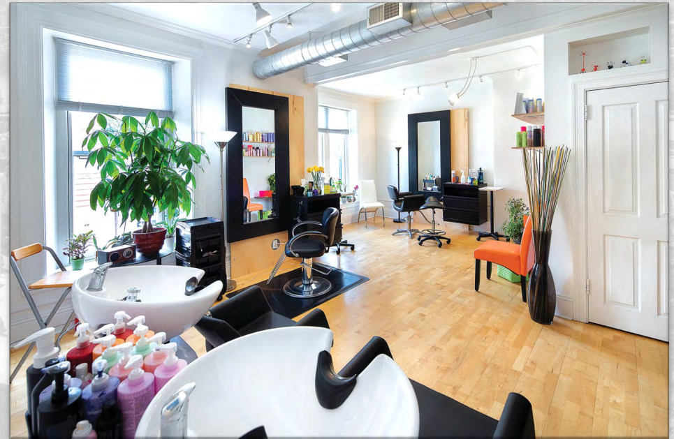
Live-Work Second Floor of 1942 Entrance and hair salon of Moxie Chop Studio Large bedroom and kitchen, laundry room and small living room

Entrance of startup Apollo Neuroscience—6 work here Previously an apartment with living room, kitchen and 2 large