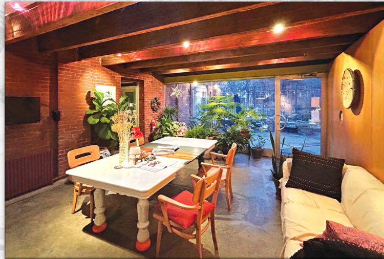
Kitchen is presently shared with business residents