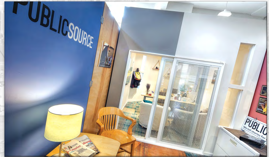
PublicSource occupies the main studio