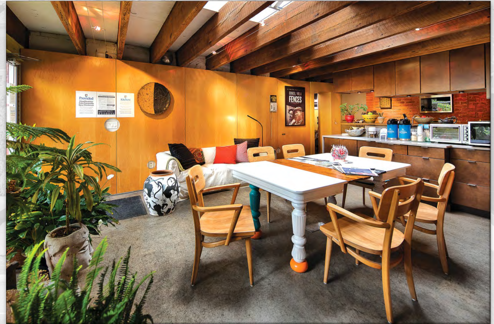
Main entrance from courtyard into kitchen—large skylight above