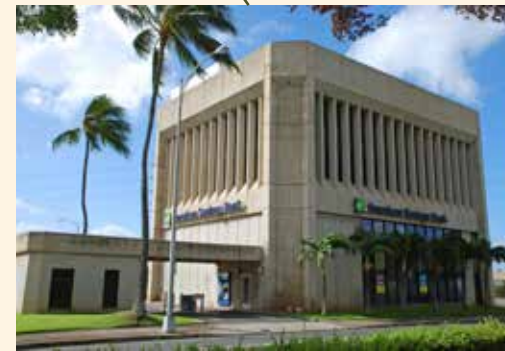
AMERICAN SAVINGS BUILDING