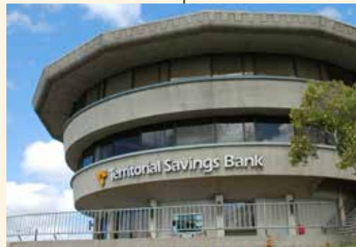
TERRITORIAL SAVINGS BANK BUILDING