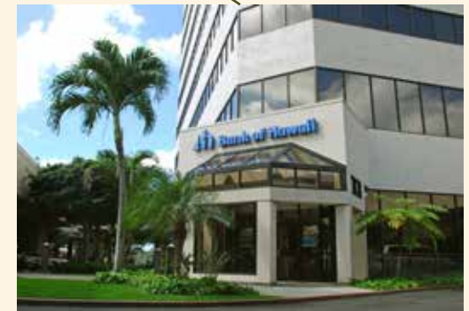
PEARLRIDGE OFFICE CENTER