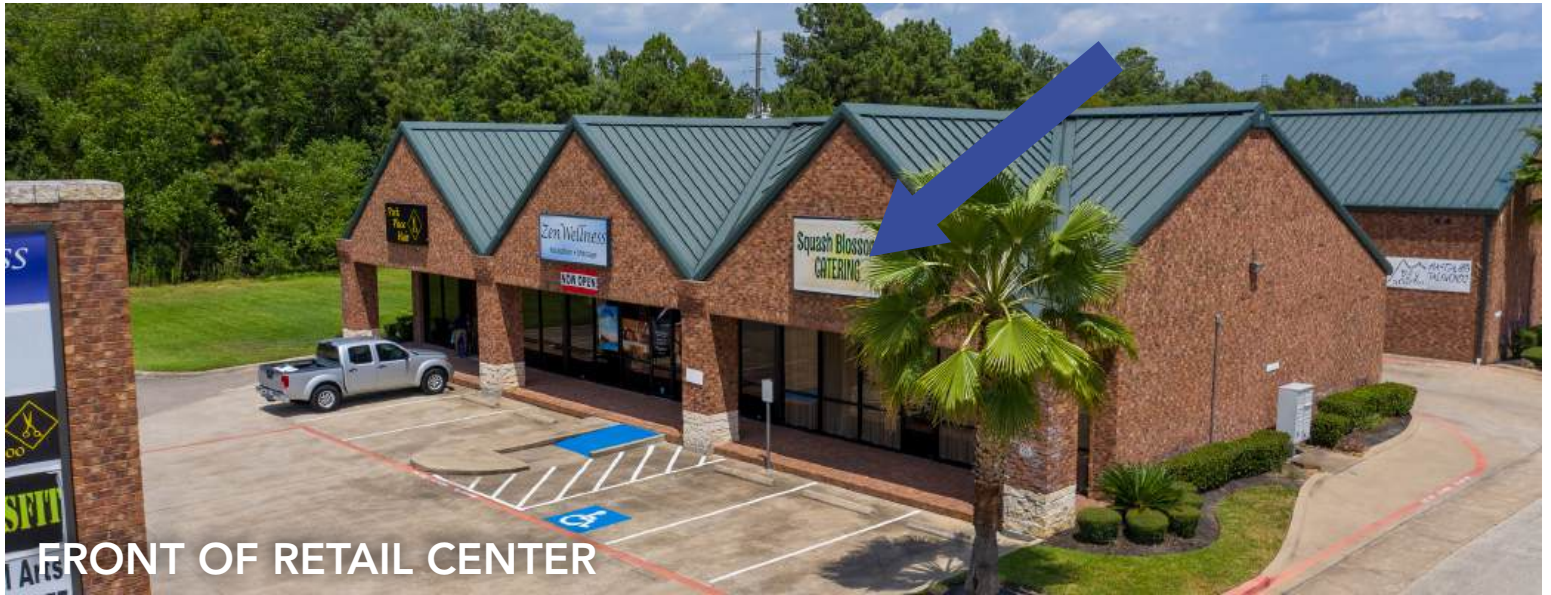
FRONT OF RETAIL CENTER