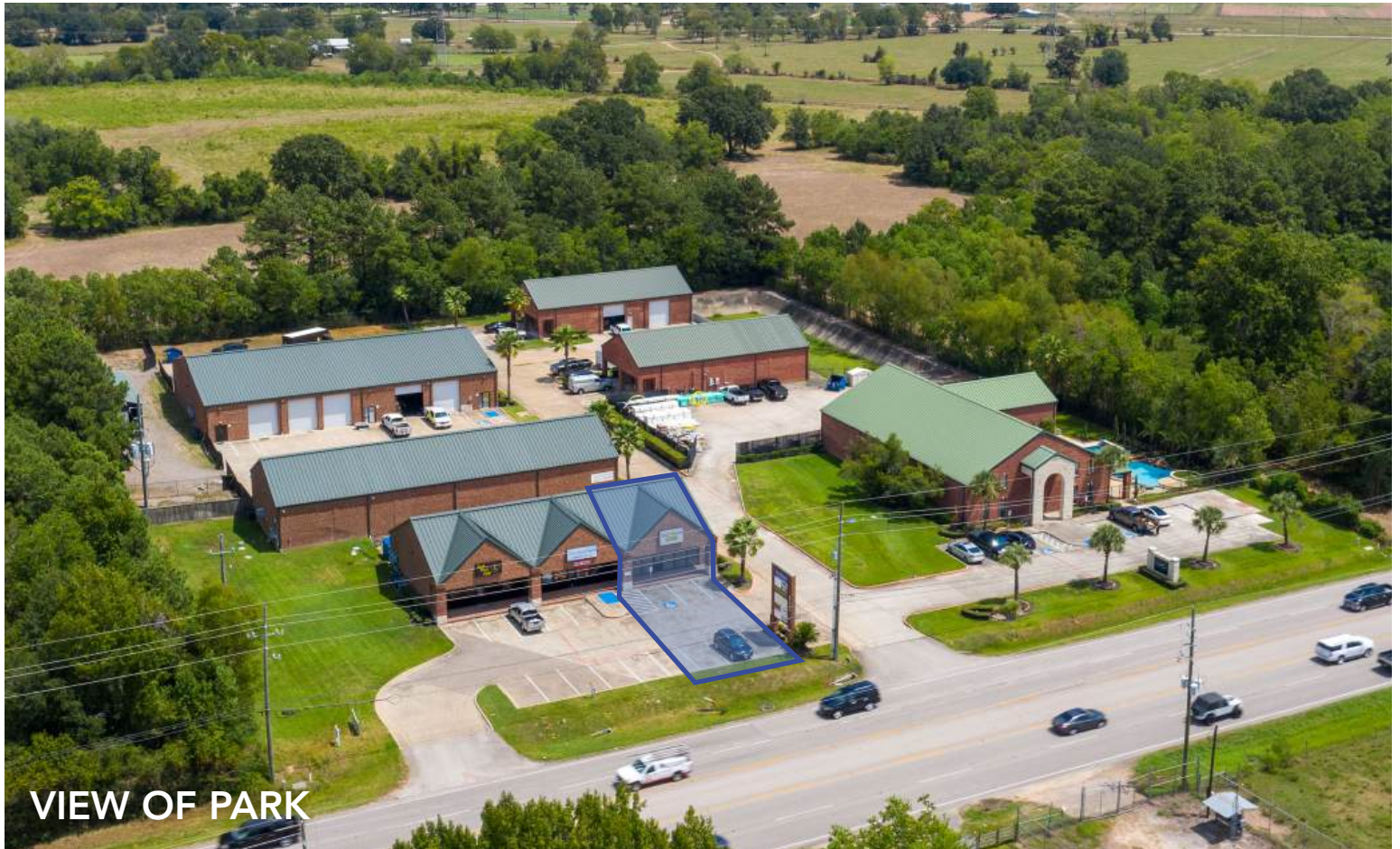
VIEW OF PARK