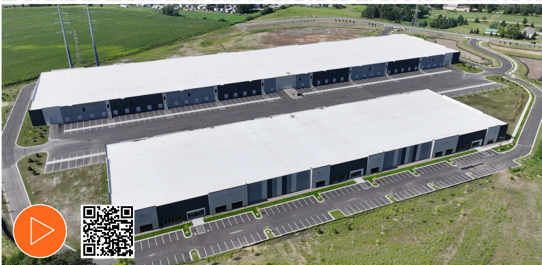
Construction photo, June 2024

©2022 Cushman & Wakefield. All rights reserved. The information contained in this communication is strictly confidential. This information has been obtained from sources believed to be reliable but has not been verified. NO WARRANTY OR REPRESENTATION, EXPRESS OR IMPLIED, IS MADE AS TO THE CONDITION OF THE PROPERTY (OR PROPERTIES) REFERENCED HEREIN OR AS TO THE ACCURACY OR COMPLETENESS OF THE INFORMATION CONTAINED HEREIN, AND SAME IS SUBMITTED SUBJECT TO ERRORS, OMISSIONS, CHANGE OF PRICE, RENTAL OR OTHER CONDITIONS, WITHDRAWAL WITHOUT NOTICE, AND TO ANY SPECIAL LISTING CONDITIONS IMPOSED BY THE PROPERTY OWNER(S). ANY PROJECTIONS, OPINIONS OR ESTIMATES ARE SUBJECT TO UNCERTAINTY AND DO NOT SIGNIFY CURRENT OR FUTURE PROPERTY PERFORMANCE.