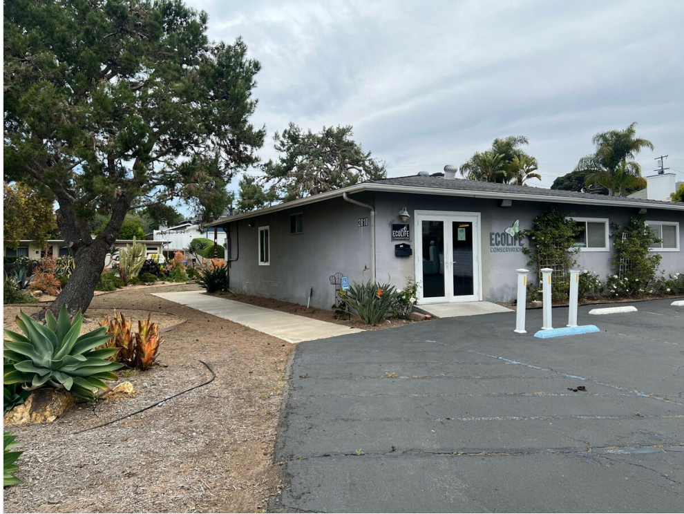
2810 Pio Pico Drive Unit A