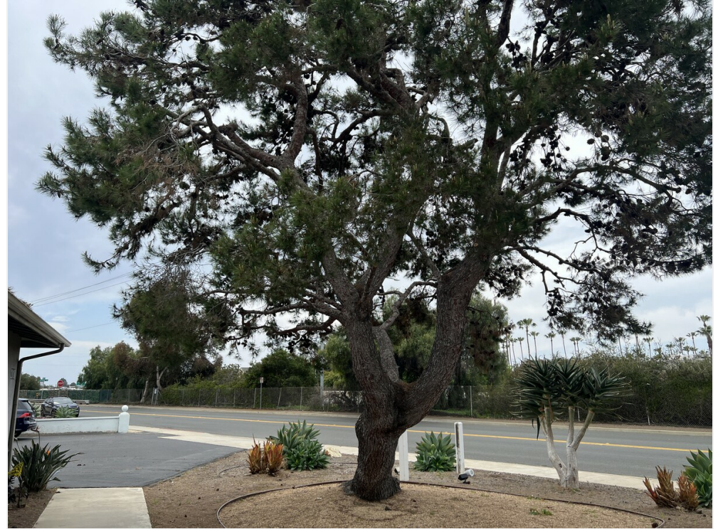
2810 Pio Pico Drive