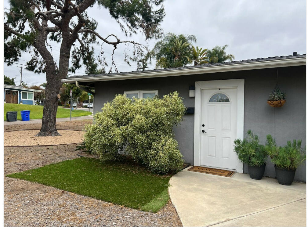
2810 Pio Pico Drive Unit B