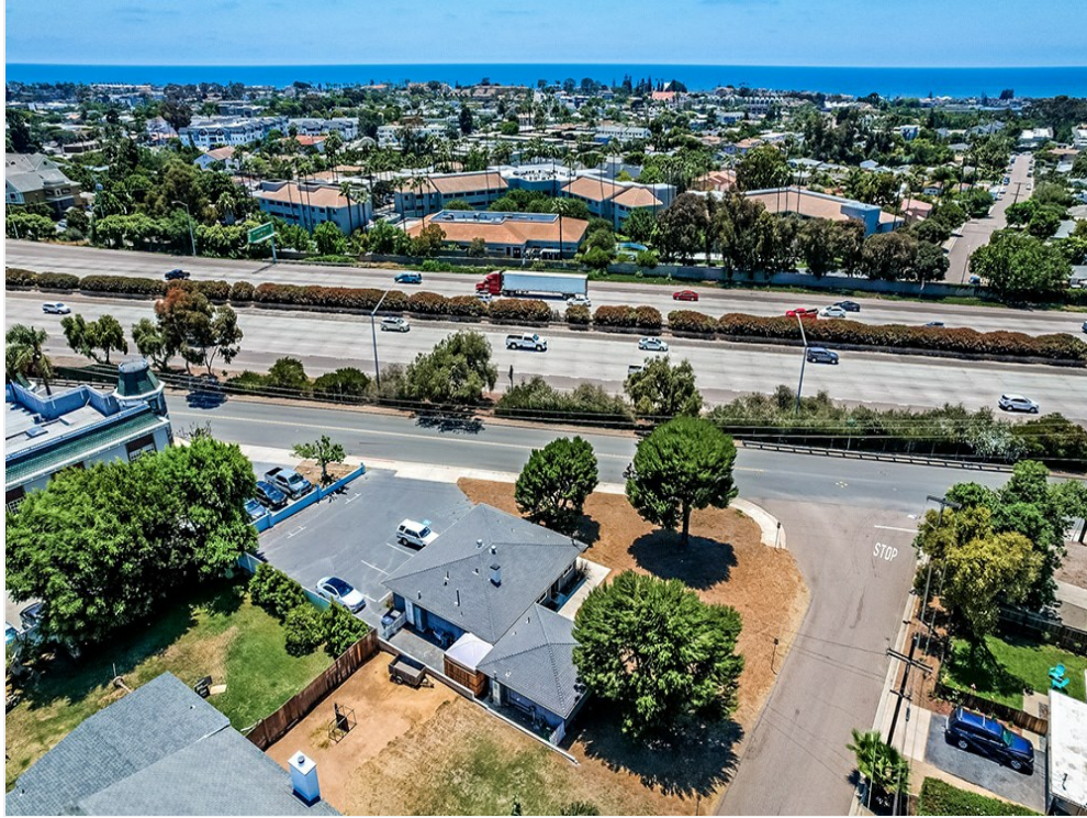
2810 Pio Pico Drive