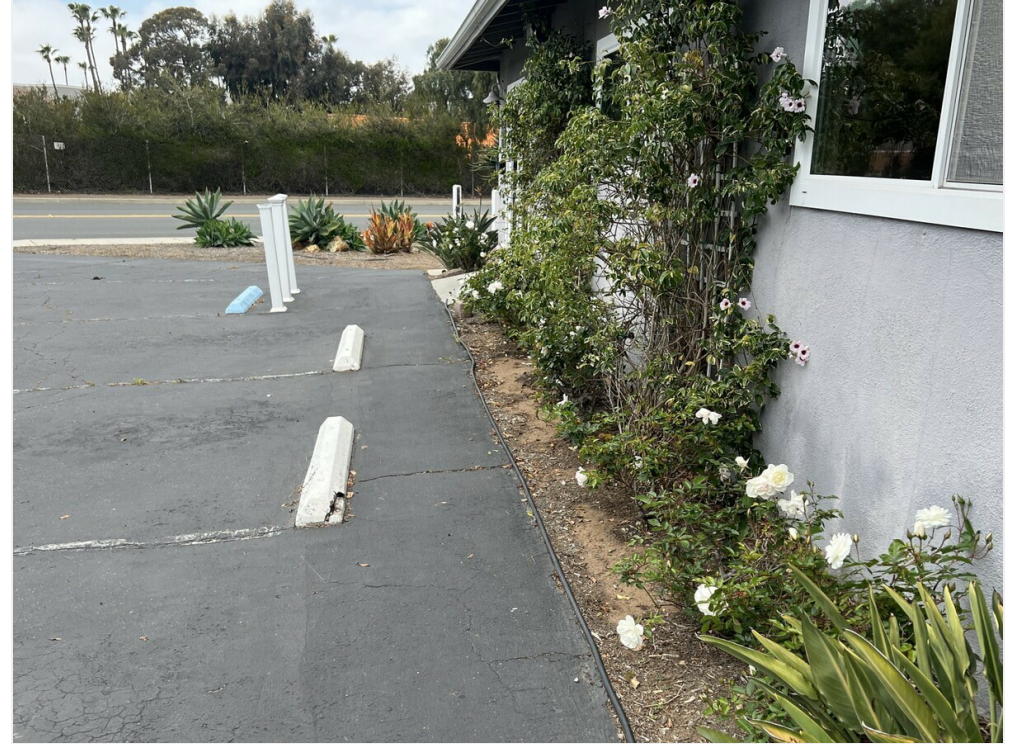
2810 Pio Pico Drive