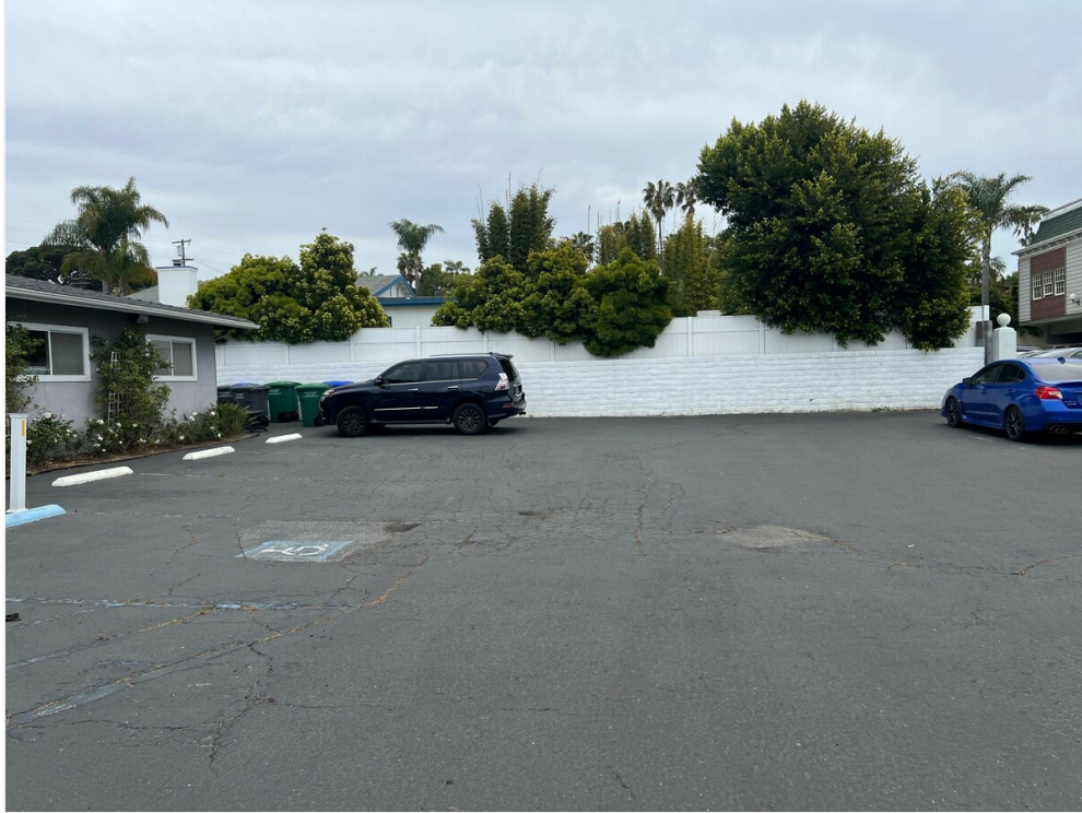
2810 Pio Pico Drive