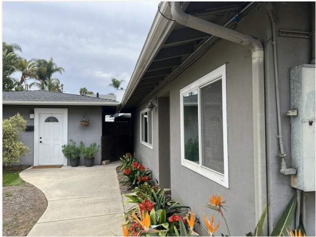
2810 Pio Pico Drive Unit A