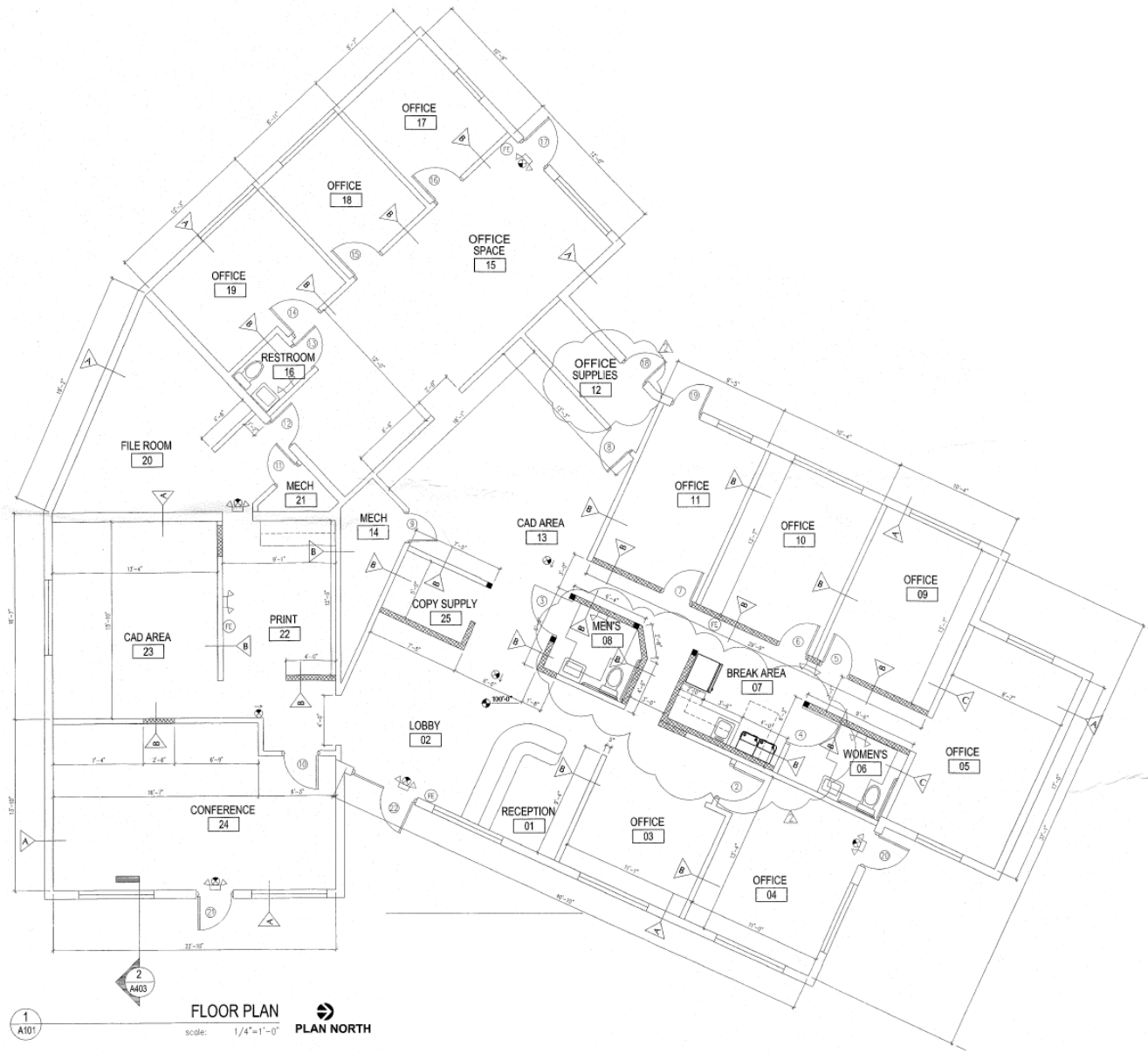
2216 Altamont Ave 3,721 SF