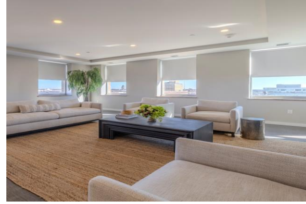
Arco Building – Residential