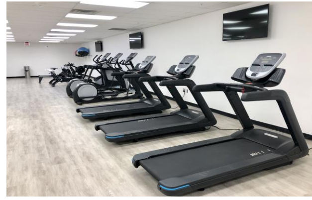
First Place Fitness Center