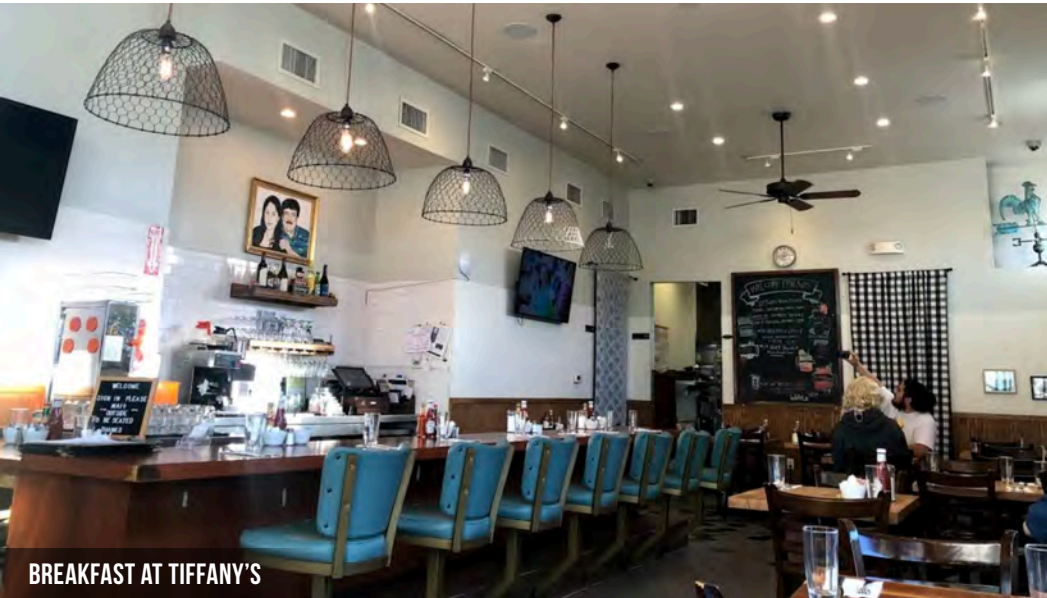
BREAKFAST AT TIFFANY'S