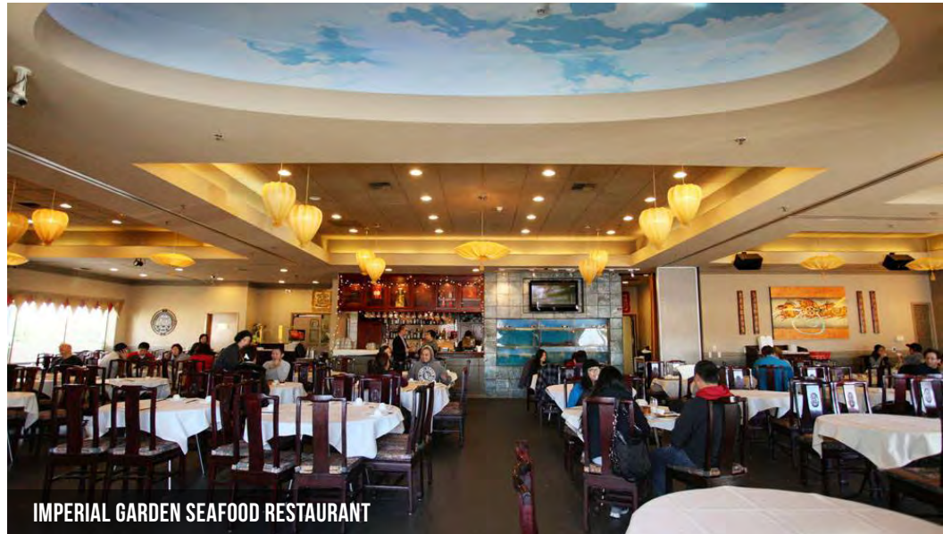
IMPERIAL GARDEN SEAFOOD RESTAURANT