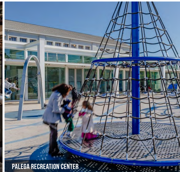
PALEGA RECREATION CENTER