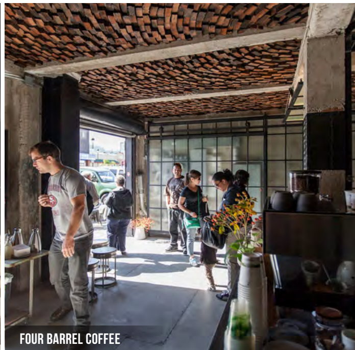
FOUR BARREL COFFEE