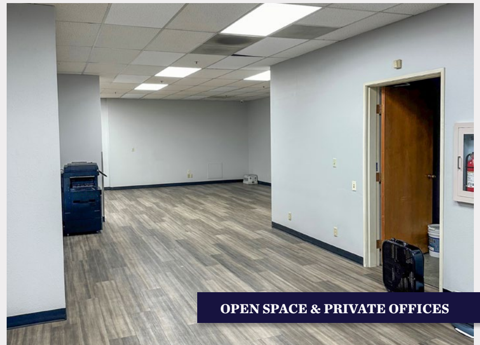
OPEN SPACE & PRIVATE OFFICES