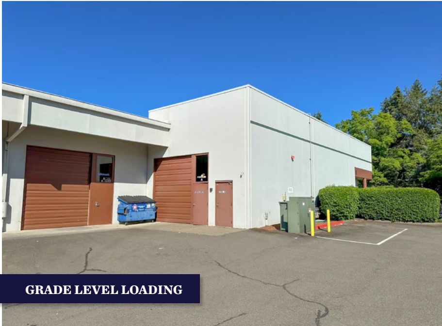
GRADE LEVEL LOADING