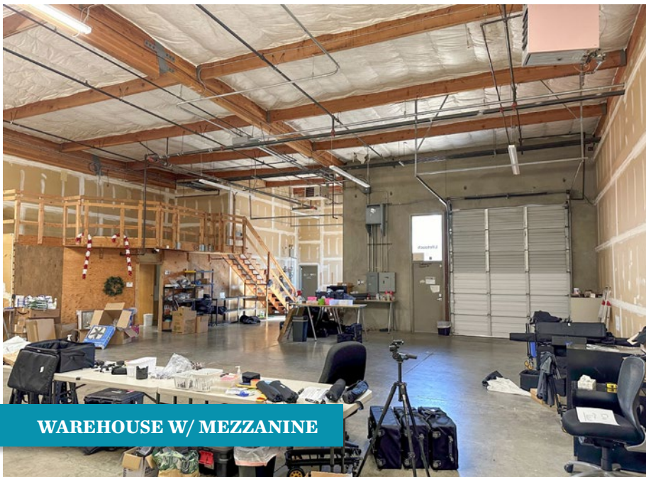
WAREHOUSE W/ MEZZANINE