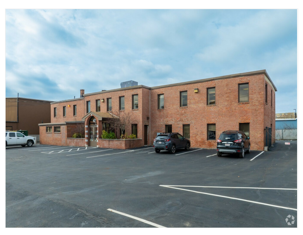
47 Hall St Main Street