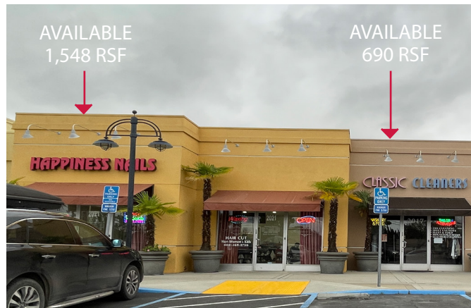
690 RSF Space & 1,548 RSF Space