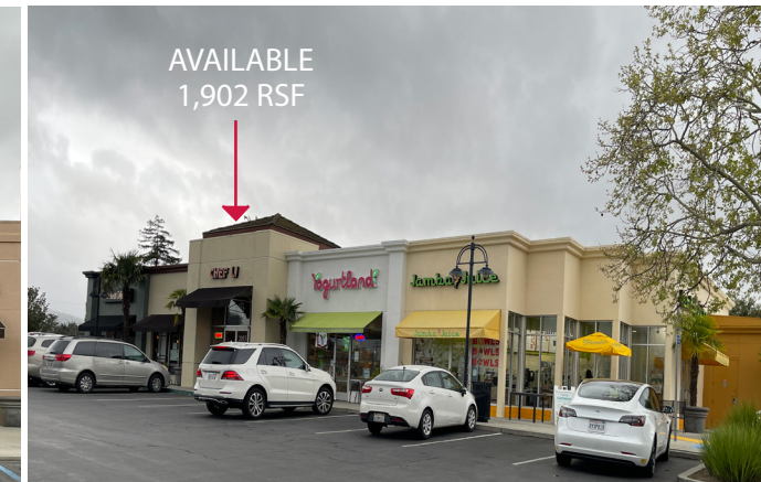
1,902 RSF Space