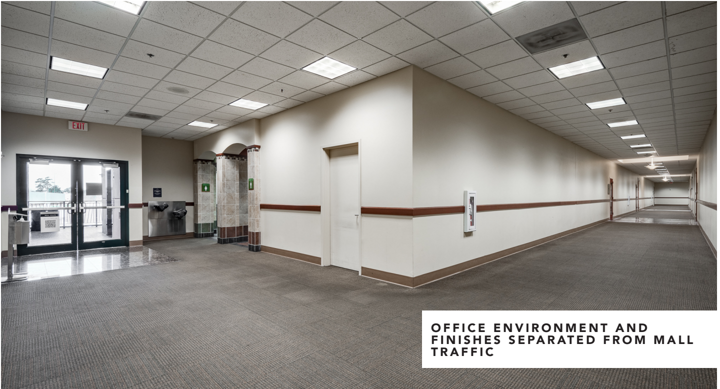
OFFICE ENVIRONMENT AND FINISHES SEPARATED FROM MALL TRAFFIC