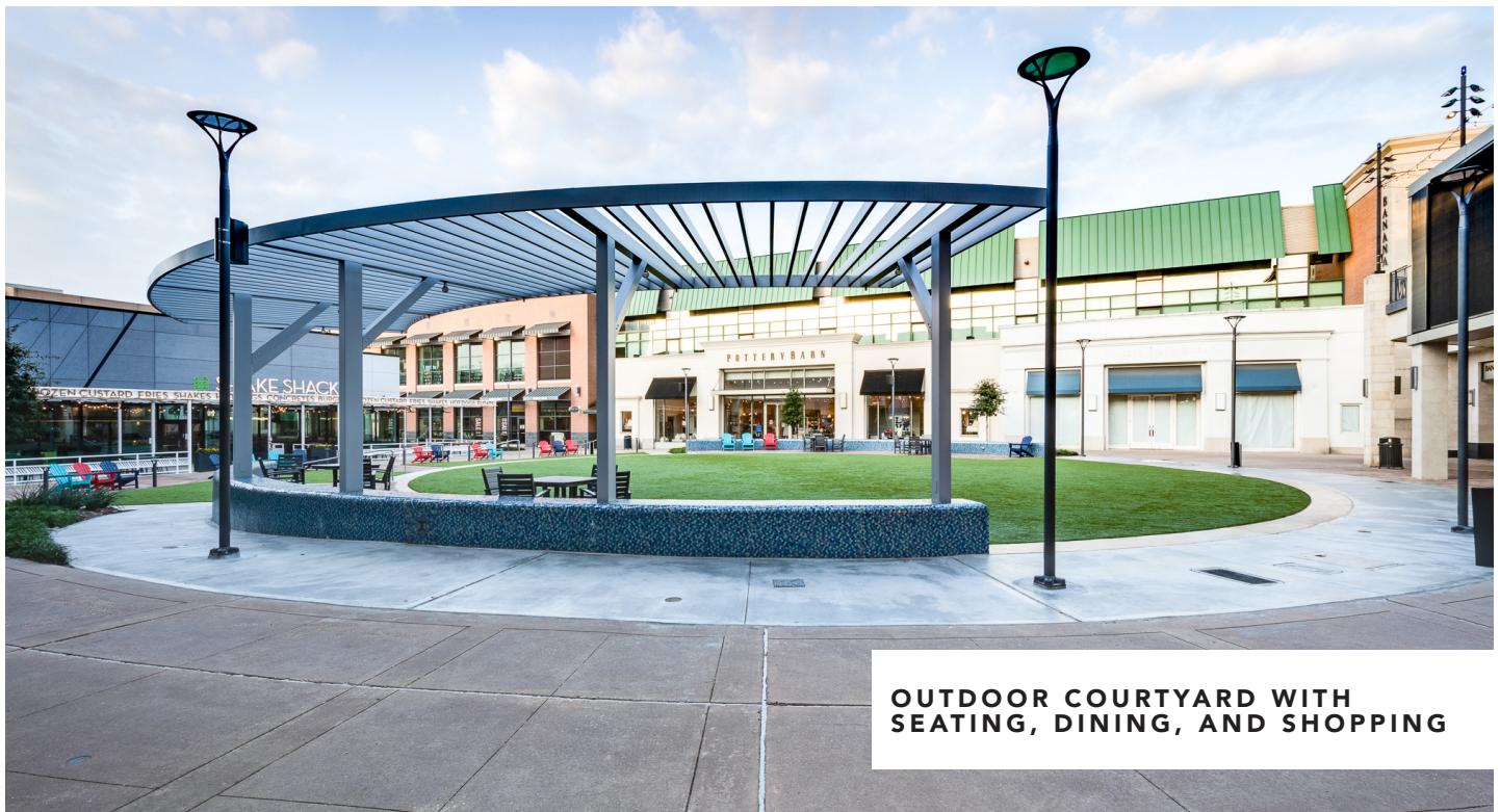
OUTDOOR COURTYARD WITH SEATING, DINING, AND SHOPPING