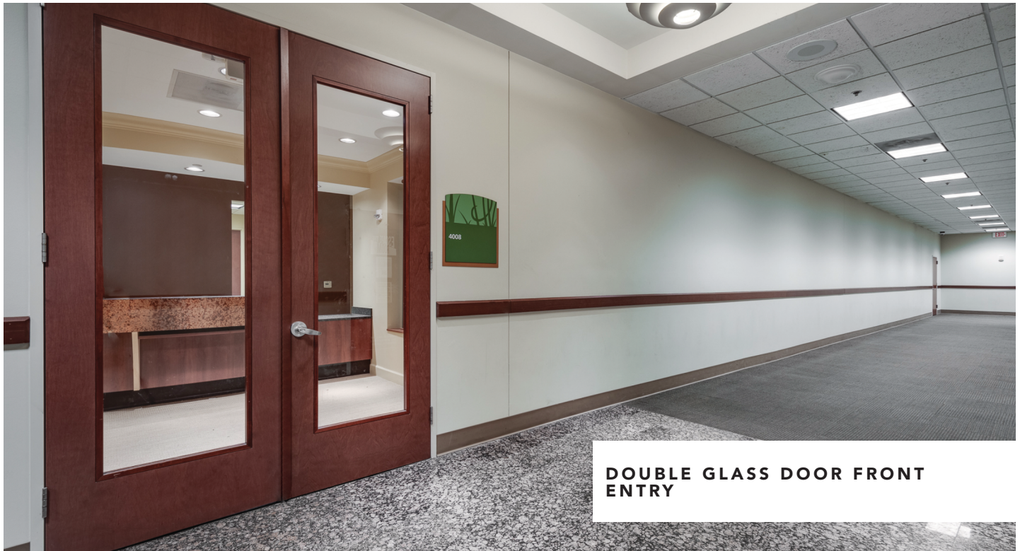
DOUBLE GLASS DOOR FRONT ENTRY