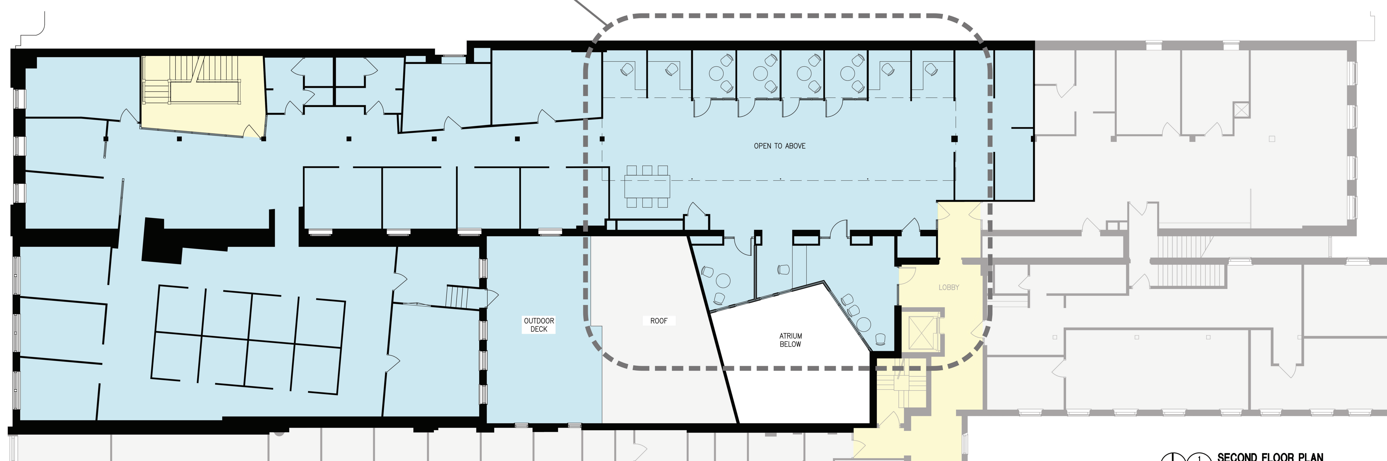
1 SECOND FLOOR PLAN A1.1 1/8" = 1' - 0"