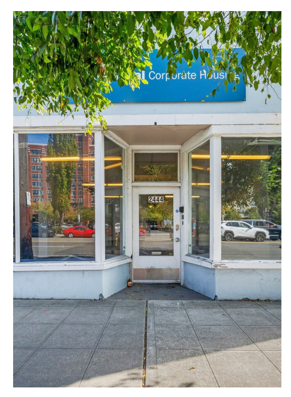
2444 Building 2444 1st Ave S, Seattle, WA 98134