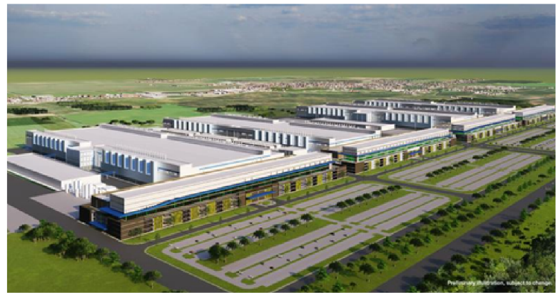
The semiconductor chip factory is slated to be constructed in Clay's White Pine Commerce Park. (Rendering courtesy of Micron). Full Story