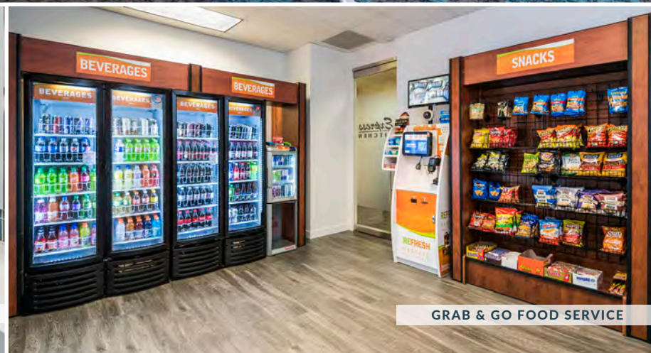
GRAB & GO FOOD SERVICE