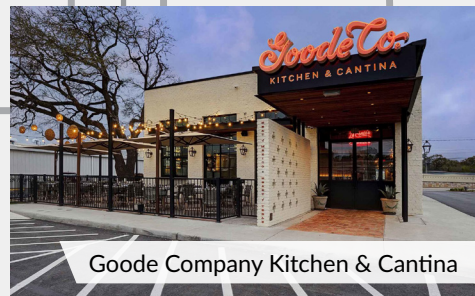
Goode Company Kitchen & Cantina