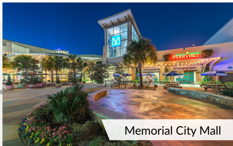
Memorial City Mall