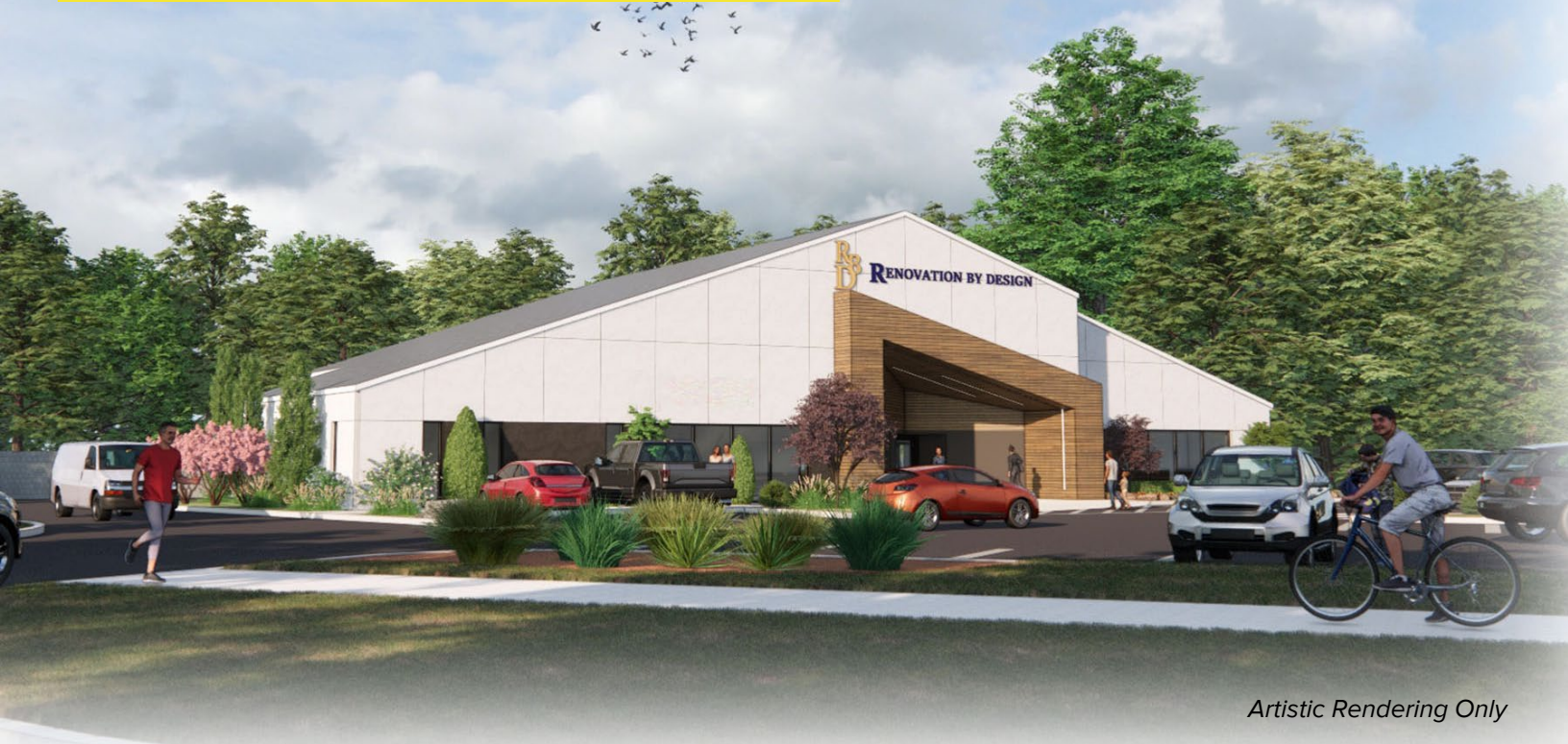
Artistic Rendering Only