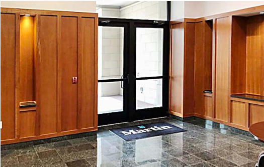
First Floor Lobby