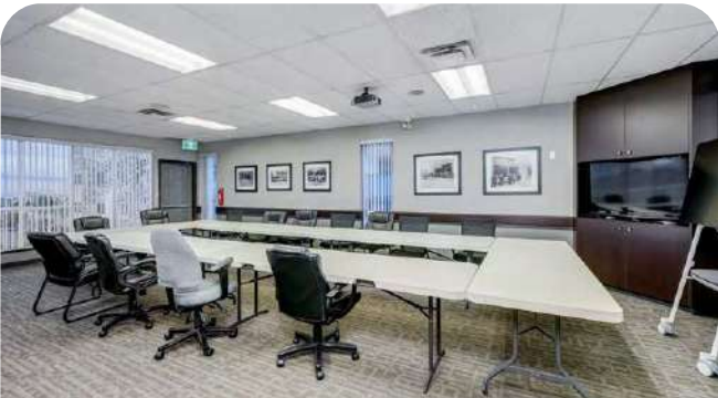
LARGE MEETING ROOM