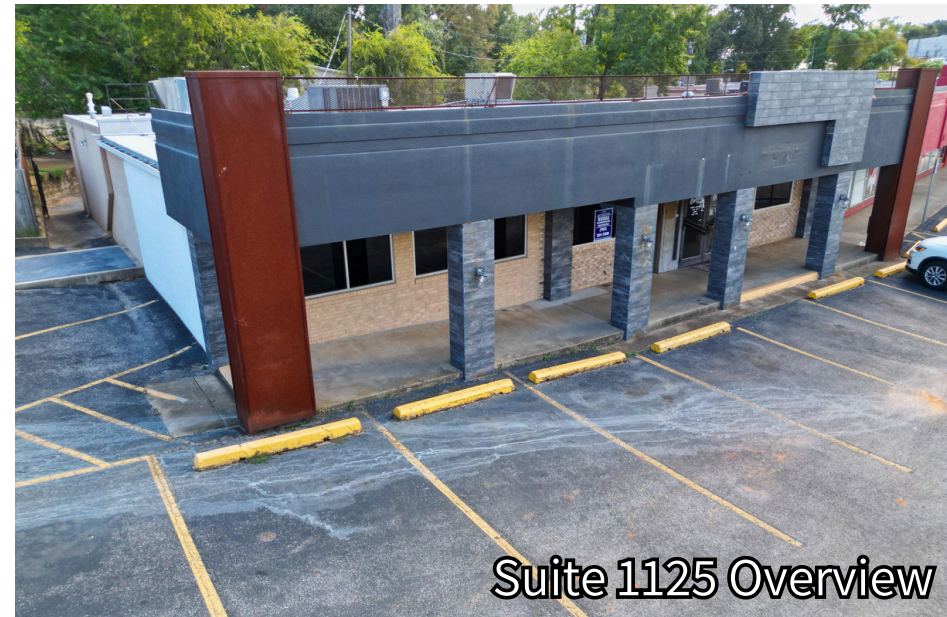
Suite 1125 Overview