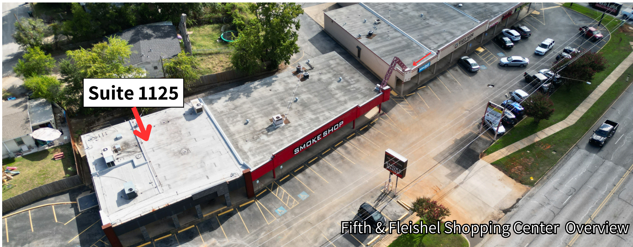
Fifth & Fleishel Shopping Center Overview